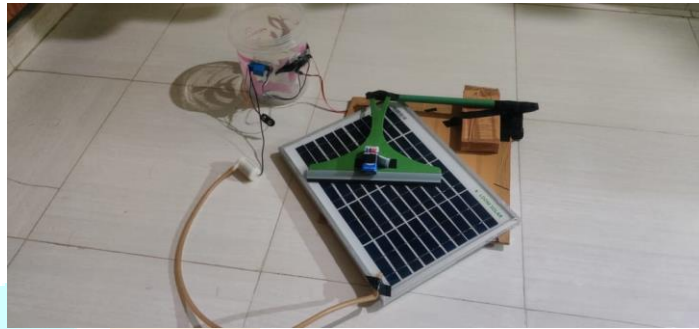
Automatic solar panel cleaning system [whole view]