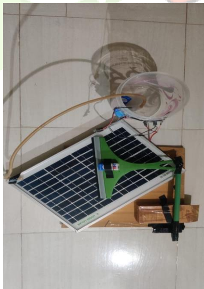
Top View of Automatic solar panel cleaning system