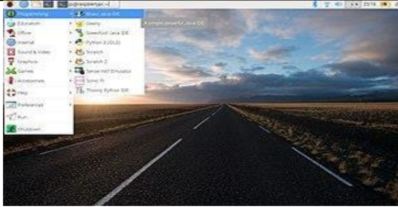
Fig5. Raspbian OS

The Raspbian desktop environments known as the “Light Weight X11 Desktop Environment” or in short LXDE. This has a fairly attractive user interface that is built using the X Window System Software and is a familiar point and click interface.