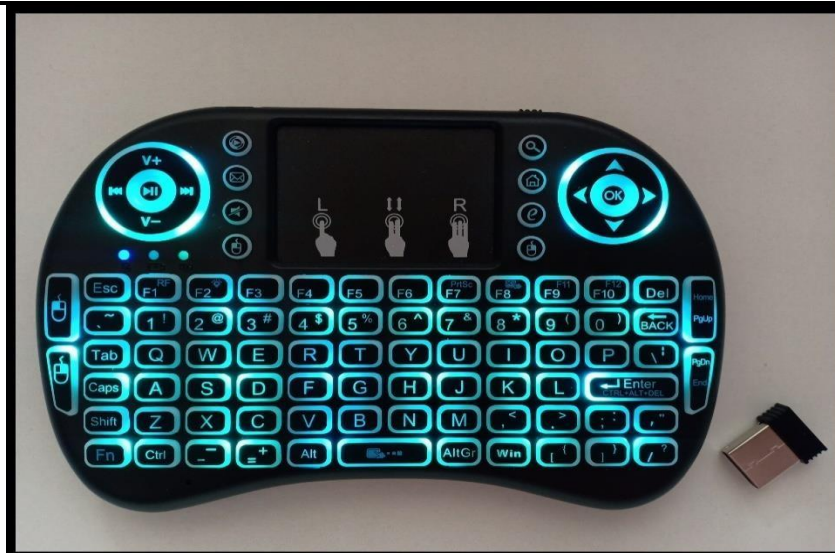
Fig3. Loopan i8 Mini Wireless Keyboard and Touchpad