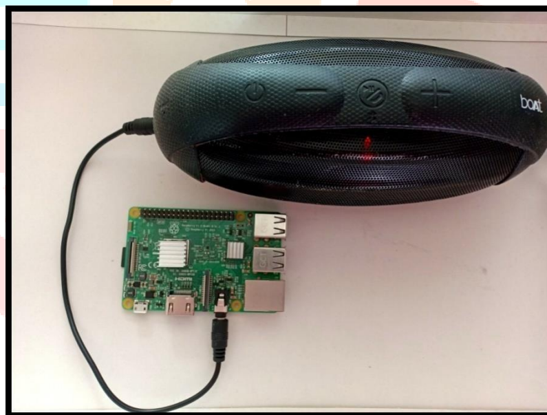
Fig4. Speakers used in project

As our project is focusing on time management of the user so it's better that user hear the daily weather updates and stock market reading instead of reading the important content from screen these can help user to save time. Moreover these speakers are loud enough that its sound can reach 20-30m in a room. Speakers that we have used does not need any additional charging as it draws the power from raspberry pi using AUX port.