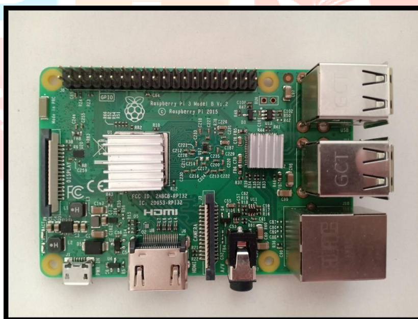
Fig1. Raspberry Pi 3