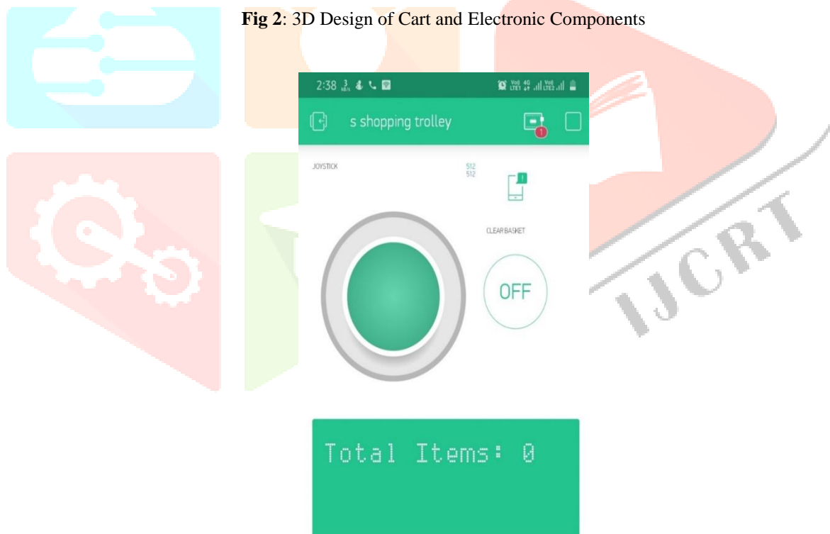
Fig 2: 3D Design of Cart and Electronic Components