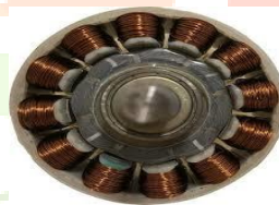
Fig. copper coils

Nearly all electricity today is produced by spinning coils of wire next to strong magnets. Much effort is put into making efficient generators, but the electricity itself is a result of the mechanical work done in spinning the generator.