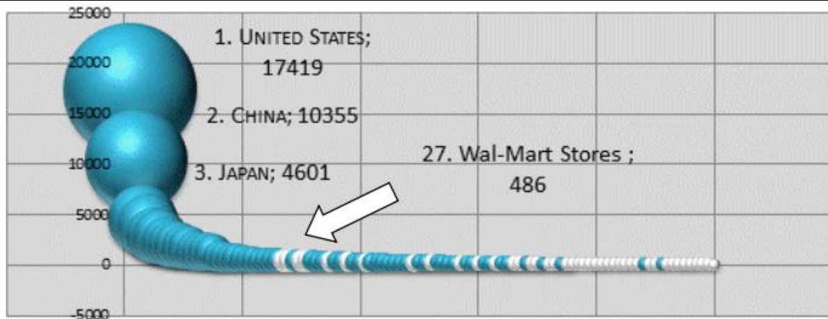
Figure 1: World's Largest Economies in 2014 (Revenues or GDP in billion USD)