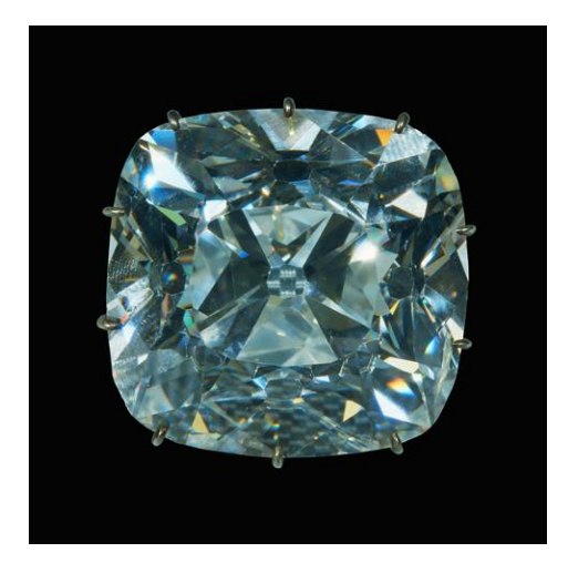
Fig. 1.19: The diamond Regent was discovered in 1698 in Golconda, India which was acquired by Thomas Pitt, Governor of Fort St George in Madras for a heavy price.