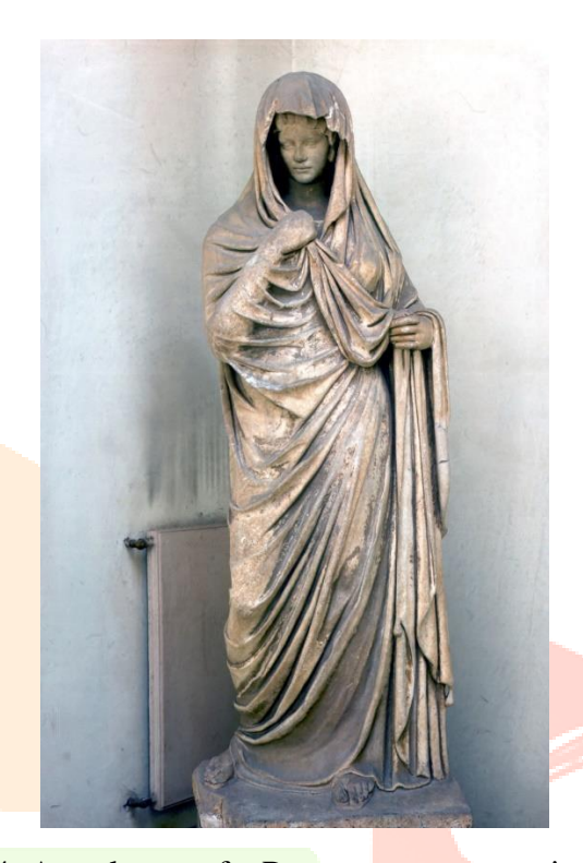
Fig. 2.4: A sculpture of a Roman woman wearing Pallu .

worn in such a way as to create a rather shapeless image, whereas the sari is a far more intricately draped garment that produces quite a different body image to the palla and the chador. The long end, however, can work in much the same way, depending on how it is worn and manipulated. The pallu is also the most highly decorated part of the sari, as its design and adornment are a selling point in shops. The Roman palla too could be manipulated as a veil, it could serve as a symbol of the modest subservience or teasing eroticism (Harlow 2014).<sup>18</sup>