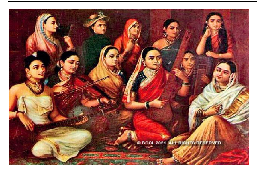
Fig. 1.5: Galaxy of Musicians, a painting by Raja Ravi Verma c 1889.