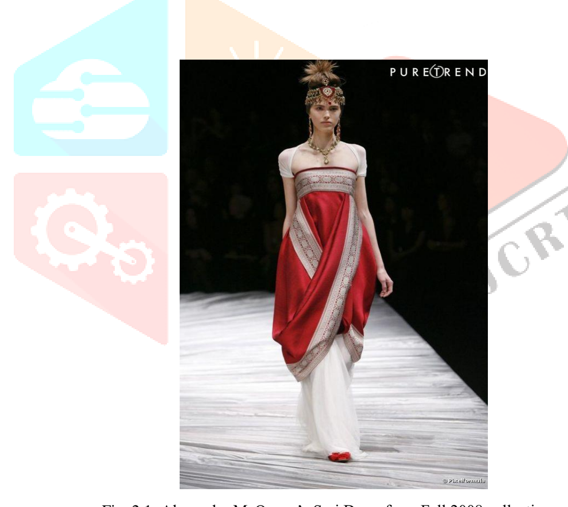
Fig. 2.1: Alexander McQueen's Sari Dress from Fall 2008 collection.

The growing popularity and suitability of the "modern" style of sari amongst educated Indian women provide a snapshot of evolving clothing styles in the 1960s in conjunction with modernizing lifestyles. Today a woman drives a car herself, plays the role of housewife, mother, professional educationist. Modern transport is a kind of enabling measure making new roles possible and forcing the reinterpretation of old ones through the freedom which it confers. The salwar kameez is the perfect hybrid choice for women who were looking to modernize their clothes, yet be traditional. Due to resembling a shirt and trouser ensemble, where the fit and proportions of both could be adjusted, the salwar kameez was able to take on a greater number of trends and was a more practical and accommodating choice for active lifestyles and as everyday casual wear (Sandhu 2015).^{17}