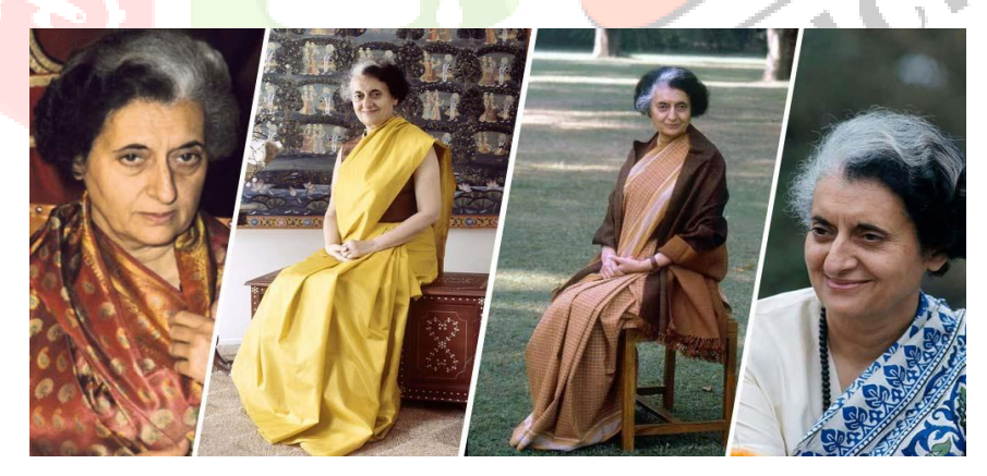
Fig. 1.6: The late Prime Minister of India Indira Gandhi wearing various sari prints and styles to reflect the diversity of the nation.