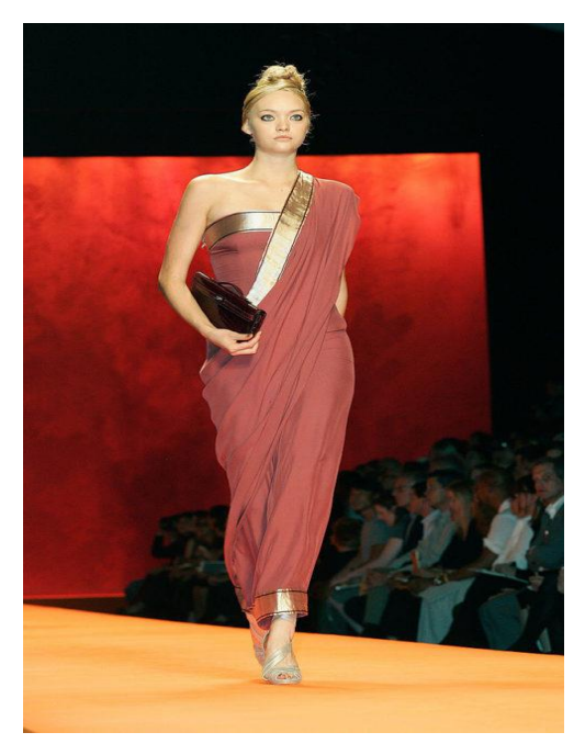
Fig. 1.7: Jean-Paul Gaultier's collection