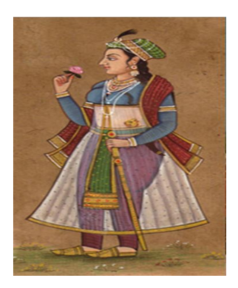
Fig. 1.13: Ancient painting of woman wearing Anarkali during Mughal period.