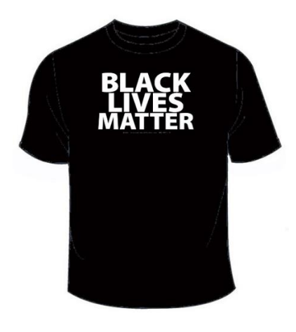
Fig. 1.9: Community Slogans.