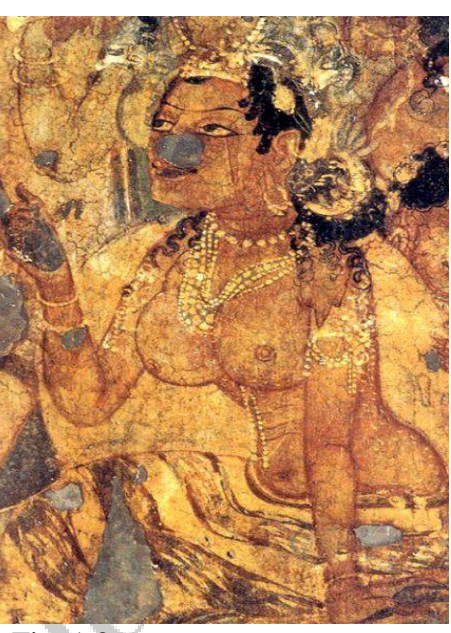
Fig. 1.3: Ikat garment as depicted in a cave painting in Ajanta caves.