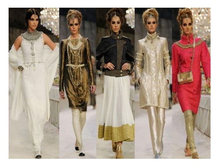
Fig. 1.18: Models wearing Maangtikka at Chanel Bombay Paris Collection 2012-13