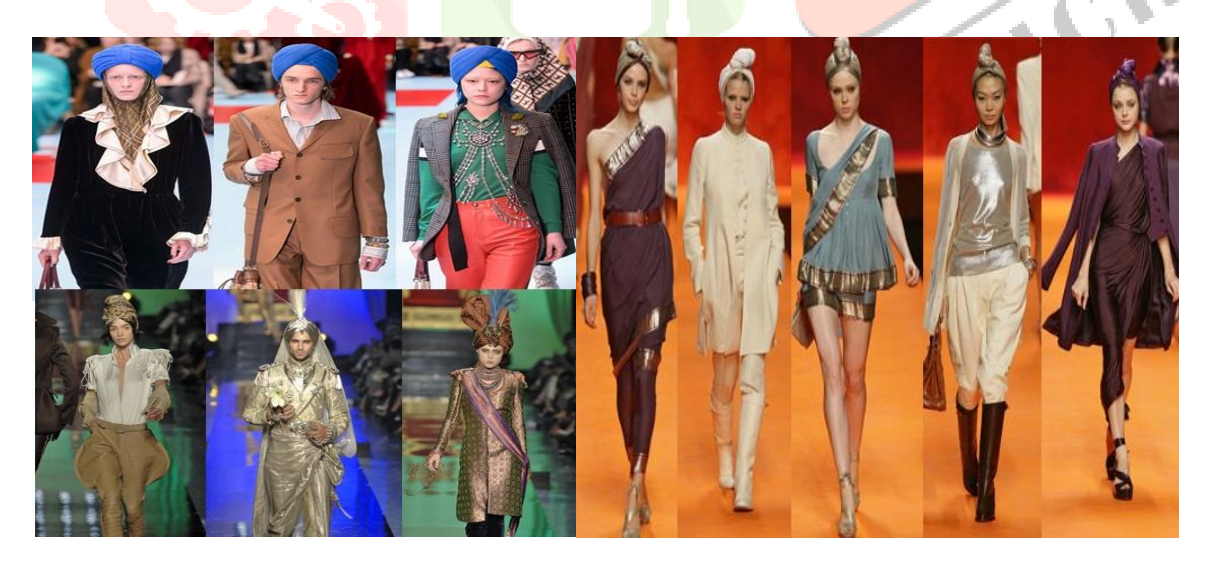
Fig. 1.15: Models showcasing different styles of turbans on International Fashion Weeks.

The turban was introduced into fashionable European dress in the early fifteenth century and its usage continued until the sixteenth century (Steele 2005). It has also been revived in international women's fashion and has acquired a more contemporary form in the twenty-first century. Various fashion designers and couturiers have adapted the turban to give it a more fashionable and chicer look, making it a popular fashion accessory displayed in the international fashion weeks (Fig. 1.15).