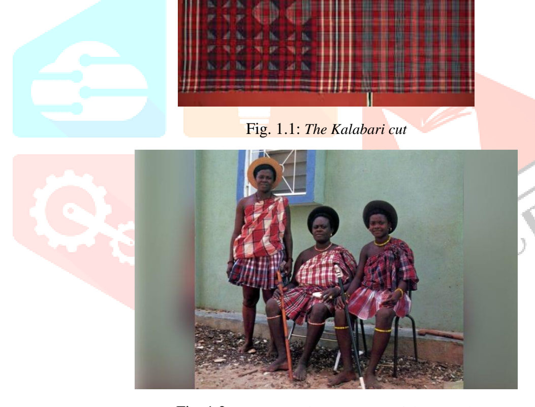
Fig. 1.2: Nigerian tribes wearing Kalabari textile

In the modern era too, Indian textiles have impacted other cultures from the African continent. "Intorica" a term created from the words India to Africa as highlighted by Eicher (2014) is a label that is placed on specific textiles which are handwoven in India and are bought in Nigeria. Nigeria and India share a brief history of Kalabari textiles produced in India and traded to Nigeria. "Pelete Bite" is the major textile for the Kalabari people living in Kalabariland, which are the islands found in south-eastern Nigeria. These textiles are specially produced in Madras, the Kalabari called the hand-loomed and died-yarn which are 100% cotton as "injiri" in kalabari, "real India" in English and in Madras called as RMHK(Real Madras Handkerchief) in the export system (See fig. 1.1). Kalabari men and women use them as daily wear wrappers with different patterns like Indian plaid and check cotton fabrics called "Madras" (See fig. 1.2). Such was its popularity and demand that towards the end of the 20<sup>th</sup> century, Nigeria illegalized the imports of textiles but the kalabari consumers continued to get them from the neighbouring countries where it was not banned and smuggled to Nigeria.