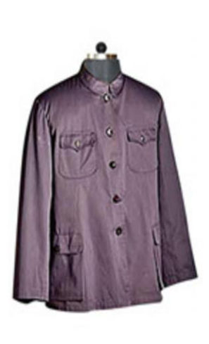
Fig. 2.6: The Beatles in Nehru