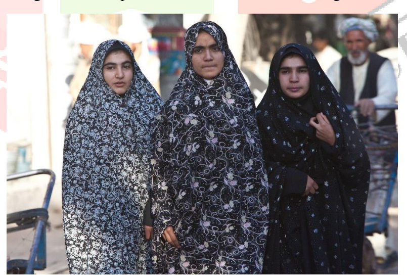
Fig. 2.5: Iranian women wearing Chador .

The famous Nehru jacket worn by men in the United Kingdom, United States, and Europe differ from the upper-body garments worn by Jawaharlal Nehru, independent India's first Prime Minister (1947-1964), after whom the Western garment is named. The Nehru jacket is similar to a Western man's tailored suit jacket, but with a difference. The collar and lapels are replaced by a front-button closure rising to a high, round neckline surmounted by a narrow stand-up collar. Sun Yat-sen (or Sun Zhongshan), Provisional President of the new Chinese Republic proclaimed in 1911, is credited with the modernization of Chinese men's dress. By the early