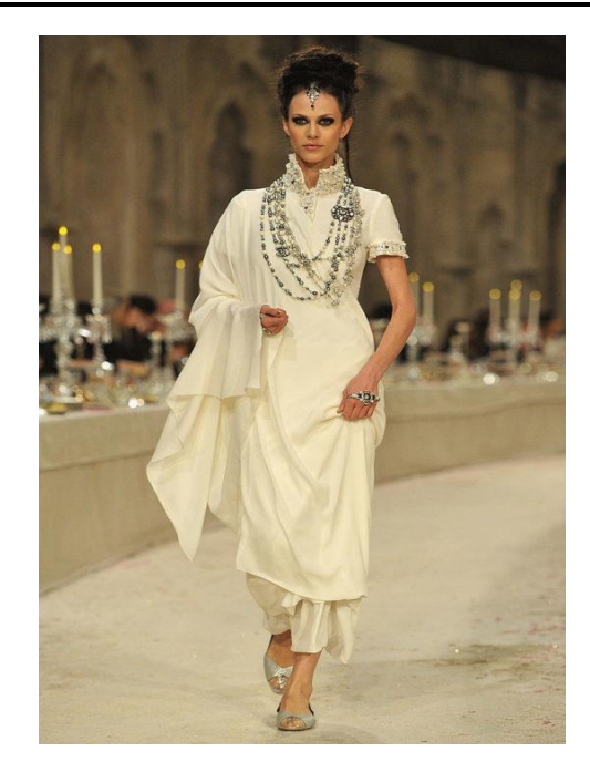
Fig. 1.8: Karl Lagerfeld's vision of Chanel Pre-fall 2012 show.