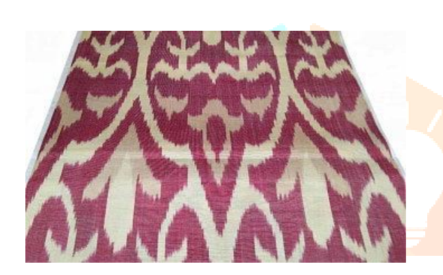
Fig. 1.4: Uzbek Ikat fabric.

As reviewed by Martens (2014) Indian cotton textiles were one of the first widespread global commodities and is perhaps the earliest case of a fashion craze globally which was of a certain quality and colour desirable to many Europeans and other nationalities throughout the history in the textile industry.<sup>7</sup> It depicts the phenomena that fashion can develop and how it gets interlinked with economics and politics.