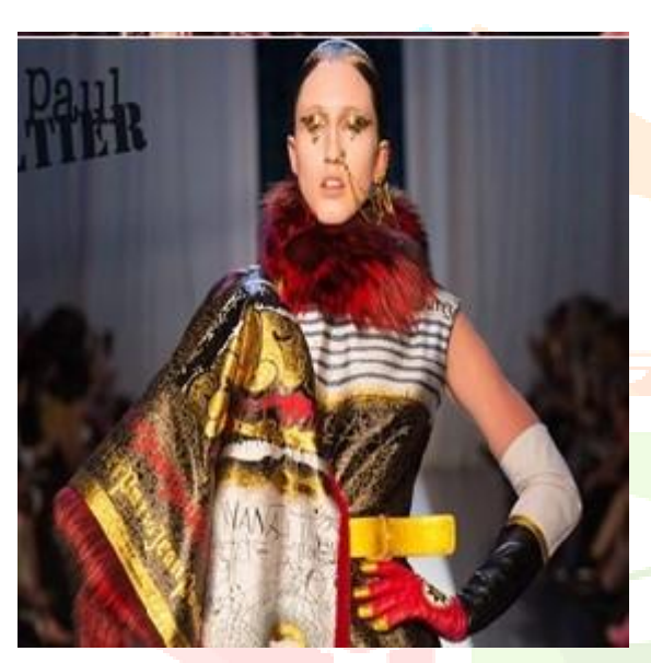
Fig. 1.17: Model wearing Nath .