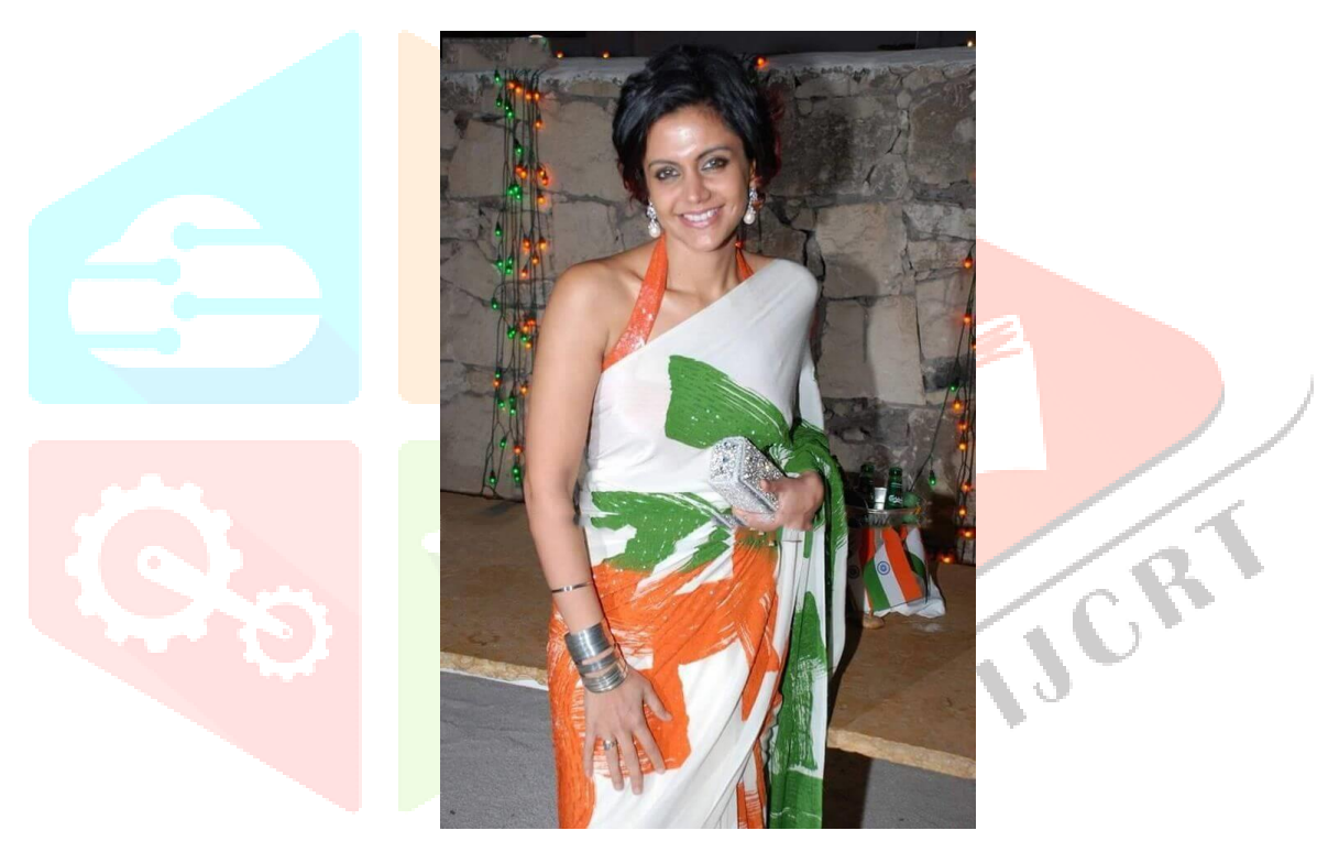
Fig. 2.3: Mandira Bedi wearing tri-colour Saree in modern style.