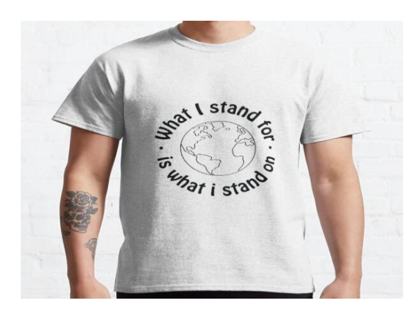
Fig. 1.10: Ecological Slogans.