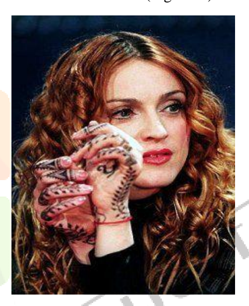
Fig. 1.16: Madonna adoring Heena/ Mehndi.