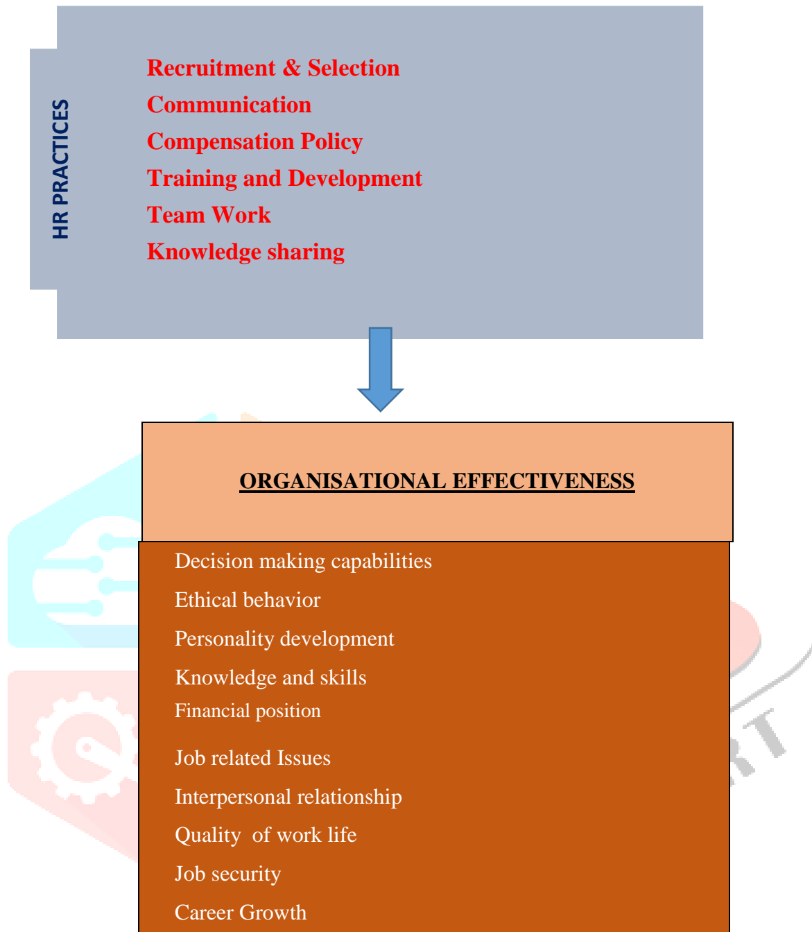
Figure 1.2 An Efficacy Model for Corporate Hospitals

An attempt to study the Organisational effectiveness has to be centered on the operative goals that an organization is pursuing. Employees are stake holders who have a good amount of interest on the existence, process, outcomes and reputation of the organization. The review of literature indicates that single indicator measures of performance as suffering from limitations and hence advocates the use of multi-dimensional systems of performance. An integration of organisational purpose and stake holder's interest will lead to construction of a multidimensional study. Performance information is important to improve Organisational effectiveness as it ensures accountability, monitor management and foster collaboration within the sector. The outcomes of HR practices may also be understood by estimating number of staff leaving voluntarily