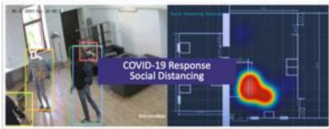
Figure 2 Artificial Intelligence and Cognitive Computing

The Cognize proprietary cognitive platform delivers situational awareness of people positions and crowding using AI and multi-sensors to detect when people are less than 6 feet apart or in groups of more than 10 people. Imagine a care system of multiple 24/7/365 autonomous sensors that can help monitor spaces in complex scenes and correlate information much more quickly and effectively than a human mind can.