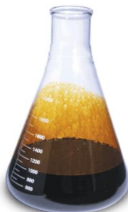
Fig: 6 Bio oil