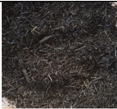
Fig 7 : Solid residue