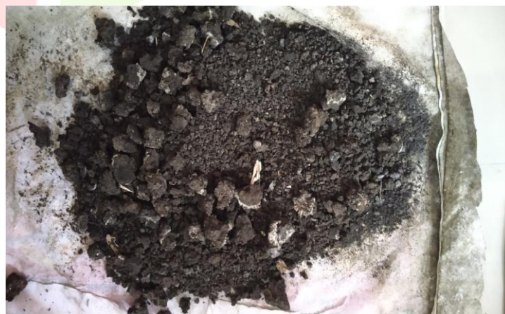
Fig 2: Municipal sewage sludge

Municipal sewage sludge was collected from municipal waste water treatment plant, Atladra, Vadodara. It was comprised mostly of water. This sludge was collected after secondary treatment in municipal waste water treatment plant. Secondary sludge was dried under direct sun for three days to remove moisture. Secondary sludge is also called activated sludge. Sludge is a heterogeneous mixture of various organic and inorganic compounds such as protein, carbohydrates, lipids, bacteria, pharmaceuticals and hormones etc. Ash concentration of sludge is very high.