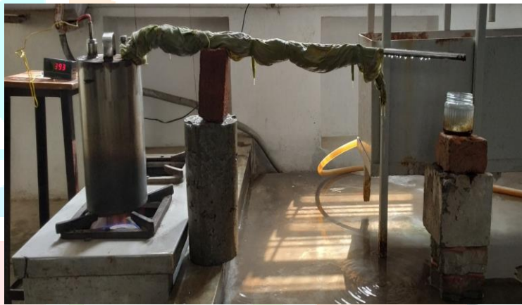
Fig 3: pyrolysis setup

Sludge was dried in hot air oven at 105°C for 2 hr to remove additional moisture content. After drying, materials were crushed and then average particle size analysis measured by sieve analysis. Pyrolysis setup contains reactor, condenser and temperature indicator with thermocouple. Reactor is made of stainless-steel material. Height of reactor is 300 mm with diameter of 160 mm. Condenser is also made of stainless steel. Temperature indicator with thermocouple is attached with reactor for temperature measurement. There are three pyrolysis products such as liquid, solid residue and gas. There are various experiments performed for sludge and bagasse as well as in different blending ratio of their mixture. There is total three experiments performed and products yields are shown in percentage. Pyrolysis experiment is performed for 120 minutes. All experiments are performed for 470°C. 300 gm of feed fed into the reactor for experiment. Liquid and solid yield was calculated by mass balance and gas yield was yield based on difference.