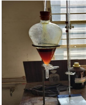
Fig. 4: separating funnel

In this pyrolysis experiment, 400 gm of sludge was fed in the reactor. Pyrolysis liquid added into the separating funnel and allowed to settle down for 24 hr. Bio-oil was separated from pyrolysis liquid by using separating funnel. 110 ml of pyrolysis liquid separates and give 40 ml of bio-oil. Water content is high as 70 ml. below figure shows image of bio-oil separation by using separating funnel.