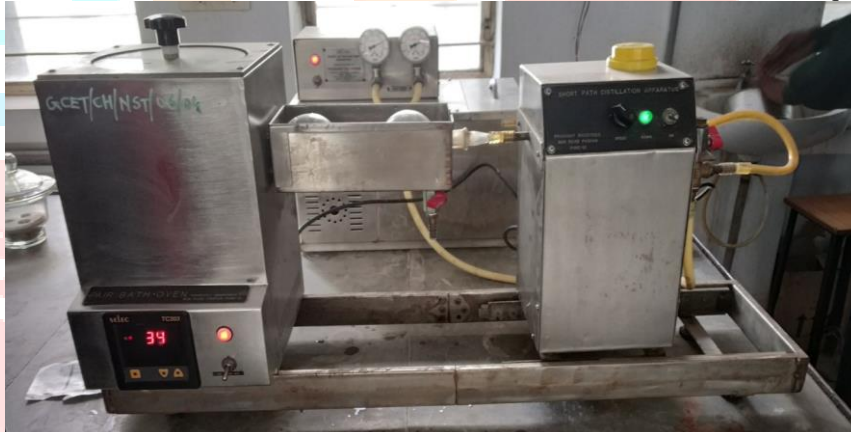
Fig. 5: Short path distillation

Short path distillation is used to separate water from bio-oil. In short path distillation, flask was filled with pyrolysis liquid. Equipment was operated at -100 mmHg pressure. Flask was heated by heating coil. Temperature for heating coil was set to 110°C. Condenser tank was filled with ice cubes. At temperature around 100°C water start to evaporate and water vapour sucked by vacuum. Water vapour comes in condenser and it condensed due to ice. Separated bio-oil remains in the flask at the end of experiment. Aqueous phase of pyrolysis oil remains in condenser. Then measure volume of collected bio-oil and aqueous phase.