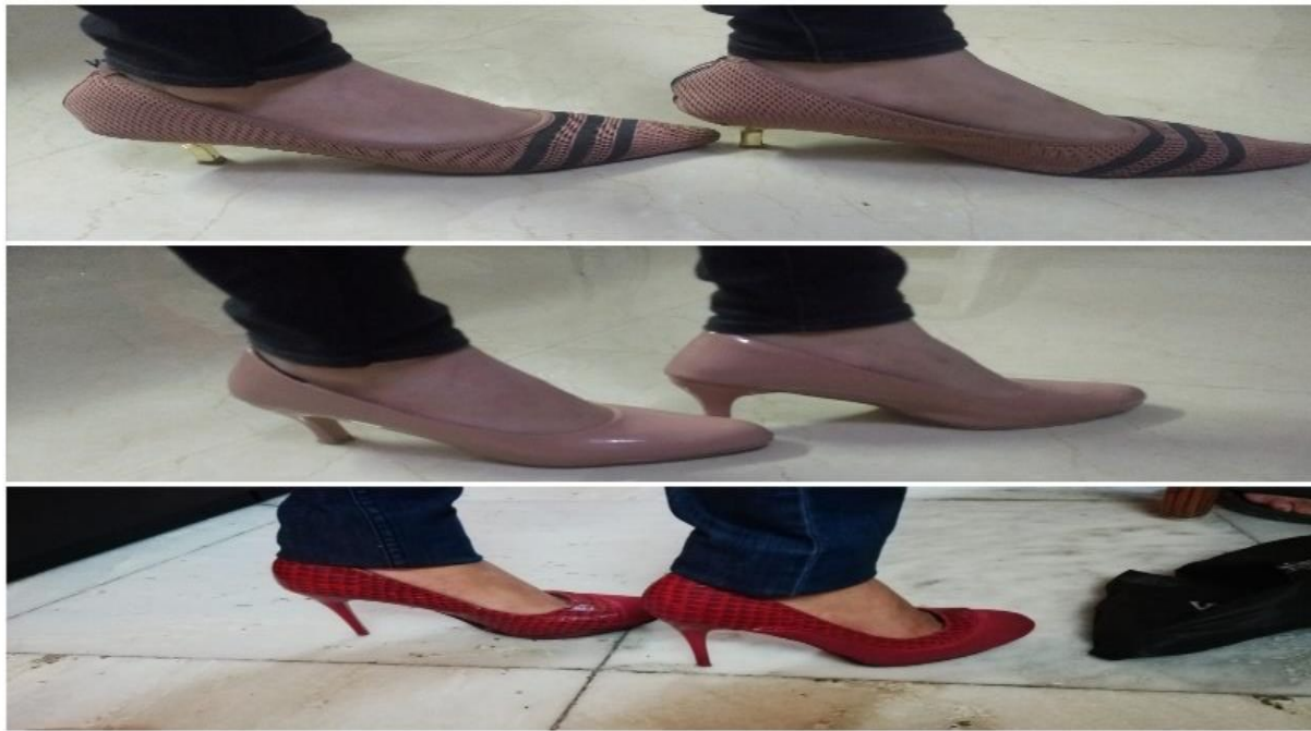
FIGURE: HIGH HEELS USED 4CM , 7CM AND 10CM OF SIZES OF HEELS.