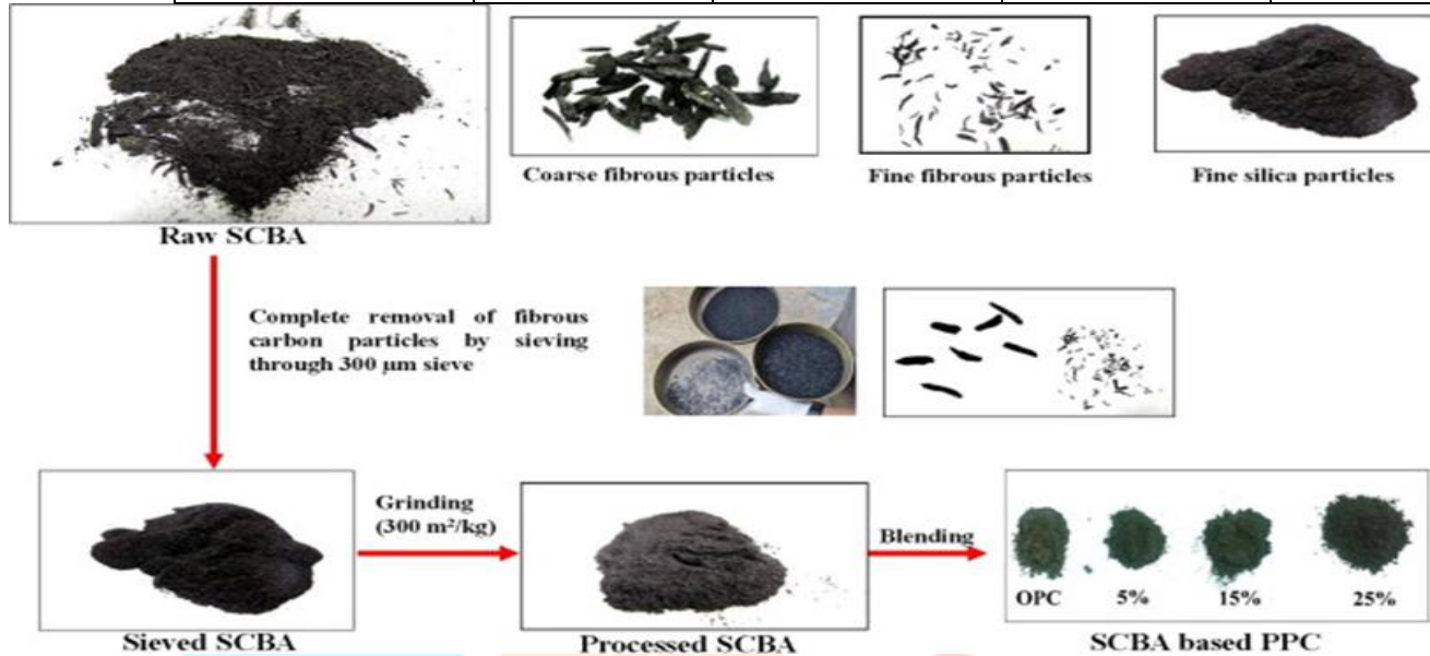
Fig 3: Production of SCBA based Portland pozzolana cement.