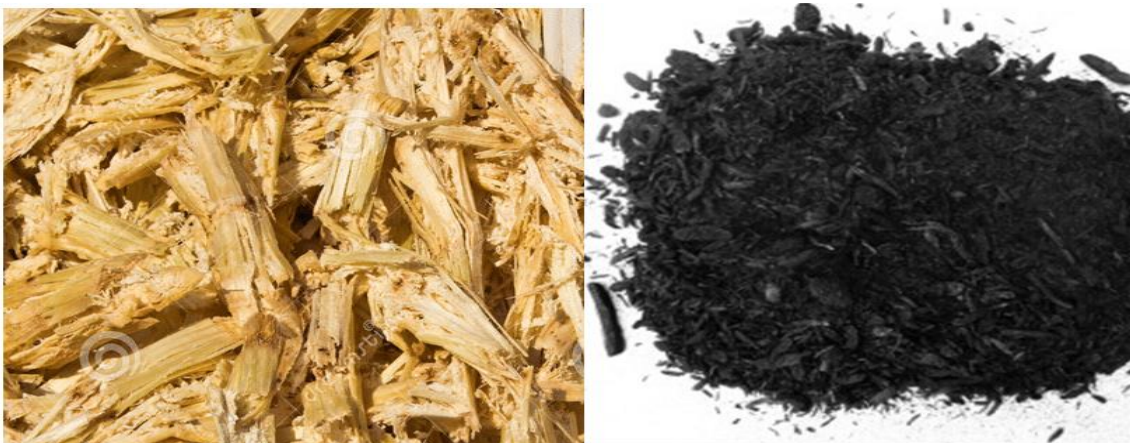
Fig.1 Sugar cane bagasse and sugar cane bagasse ash

Sugarcane bagasse ash is a composition of amorphous silica and can be used as one of the effective supplementary cementitious material in concrete preparation. Very limited investigation have been carried out on bagasse ash as supplementary cementitious material. The utilization of bagasse ash is as pozzolanic material in concrete. Therefore knowledge on the processing of sugarcane bagasse ash is fundamental.