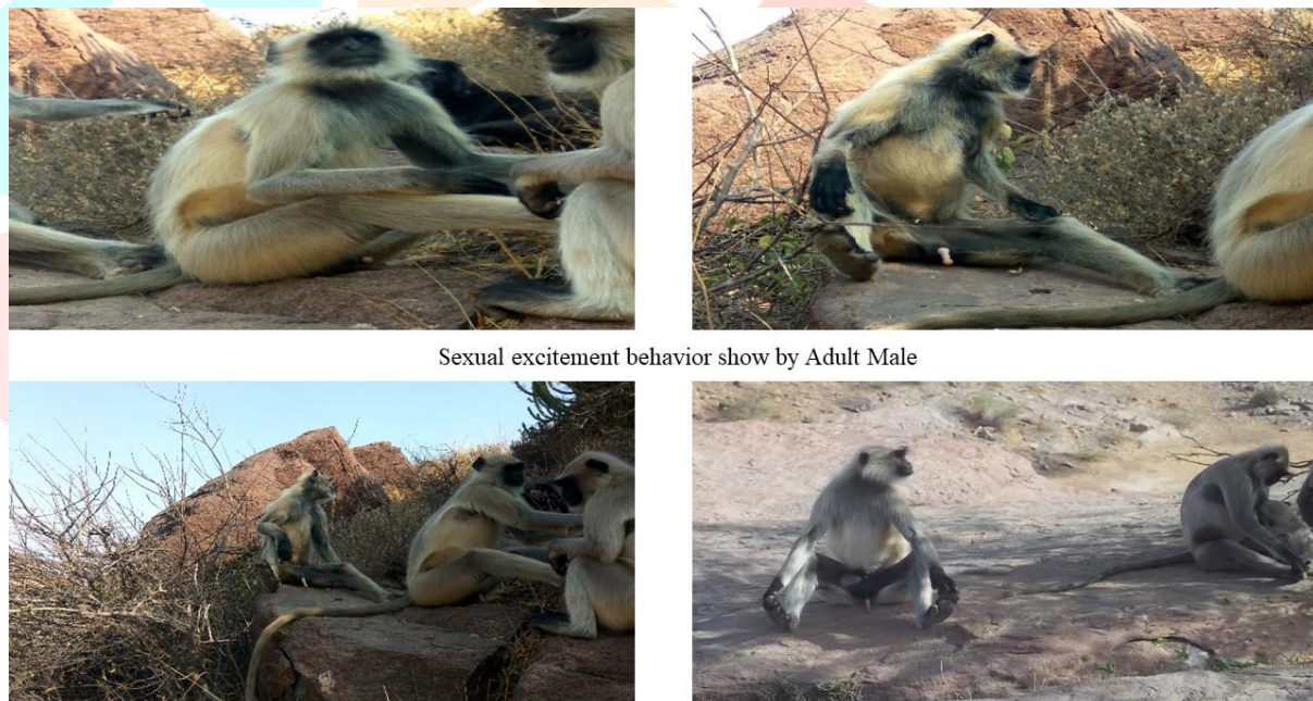
Sexual excitement behavior show by Adult Male

Sample size (N=7) (Mandore AMB adult males and alpha male of Mandore focal troop)