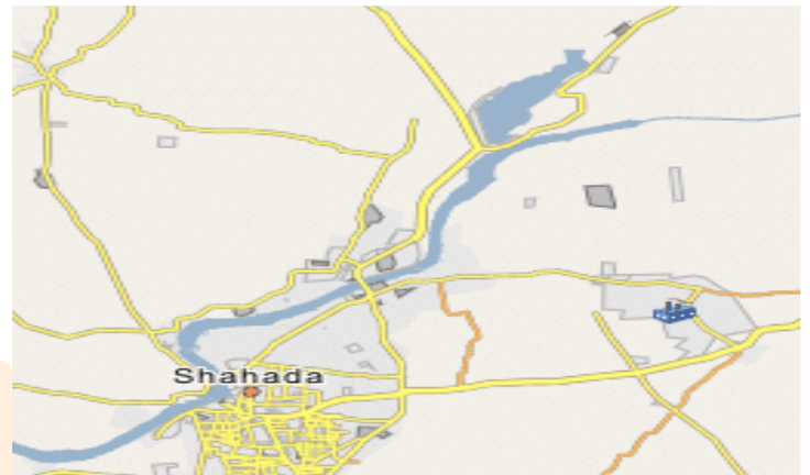
Figure no. 3.2 Map On Shahada city