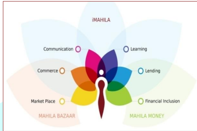
Fig 1: Functional components of eMahila

eMahila is a meticulously designed and scientifically built platform that combines three factors namely, e-learning, online collaboration and e-commerce. Fig 1 illustrates the role of eMahila in achieving their goal and also illustrates its various functional components.