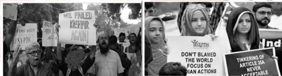
Figure 7. Shows the demurral in opposition to removal of Article 370 and Shows the youngsters proclaiming against the abrogation of article 370

(a)