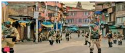
Figure 3. Military personnel deployed overnight after repudiation of Article 370