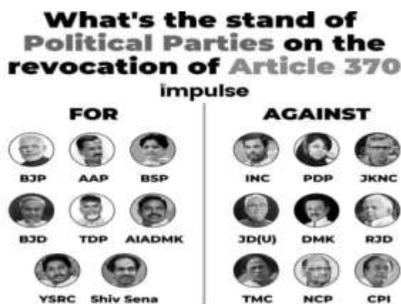
Tabel 6. Shows the India political parties main politician agree and disagree with the Article 370