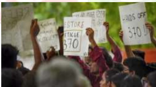
Figure 4 .Shows Kashmiri students and professionals protest in delhi and J&K.

The governor of the Jammu and Kashmir has the capacity to vouchsafe the authorization to delete Article 370. Section 92 of J & K Constitution declares that during the governor rule it is the liability of the governor to pin the announcement before the State Assembly. Governor can make provisional decisions but the final is made by the State Assembly only.