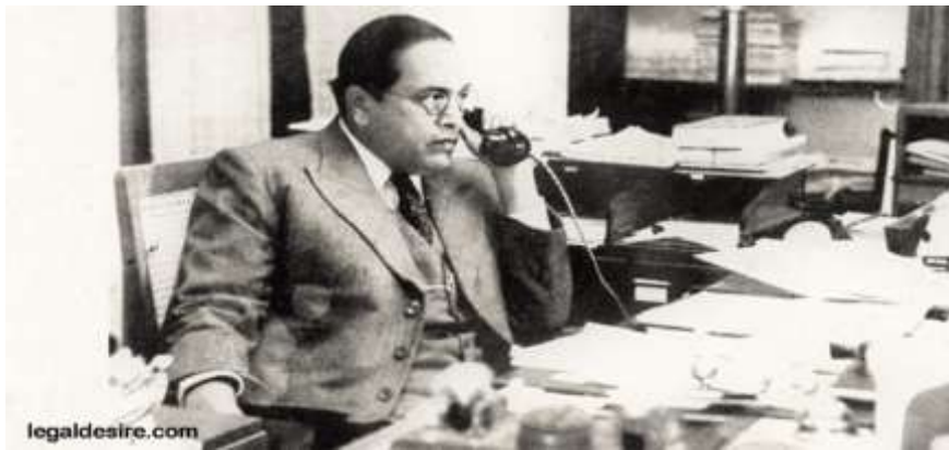
Figure 2. Shows the live picture of “the father of Indian Constitution” Dr. B.R Ambedkar.

“Article 365 is required because we all know-those of us who were Ministers during the time of the war-how these mere powers of giving directions turned out to be infructuous when the Punjab Government would not carry out the food policy of the Government of India. The whole Government can be brought to a standstill by a province not carrying out the directions and the Government of India not having any power to enforce those directions”. 6