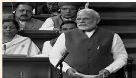
Figure 5. Prime Minister inscribes the Parliament regarding eradicating Article 370