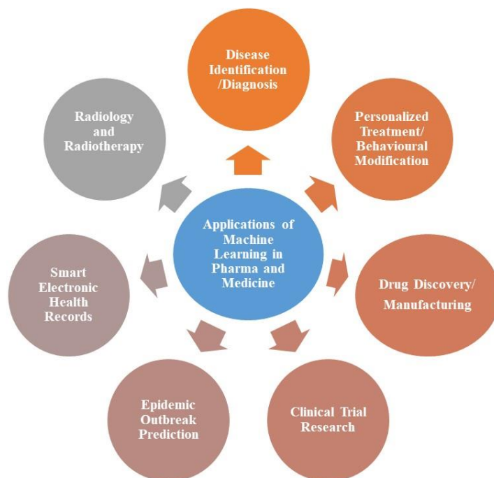
Figure 3: Applications of Machine Learning in Pharma Sector