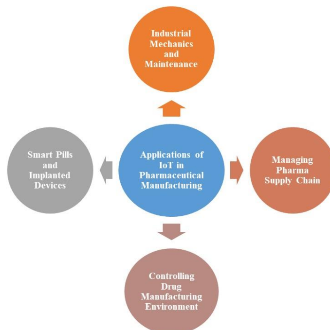
Figure 2: Applications of IoT in Pharmaceutical Manufacturing