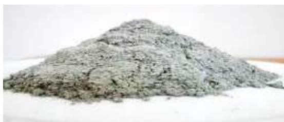
Fig. 1. Fly ash cenospheres

The chemical compositions of the cenosphere are originated from the coal source material and the combustion process. The major element in the cenosphere are the mixture of aluminium silicates with a moderate amount of Ca, Fe, K, Mg and limited occurrence of Na, Ti, S, P and trace elements. The particle size of the cenosphere can range from a diameter of 5 to 500 µm. Fig. 1 shows the nature of fly ash cenospheres