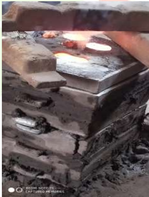
Fig. 5. Solidification process

2.6. Solidification: The fabricated magnesium metal matrix composite is then kept for cooling and for solidification. Fig. 5. shows solidification of molted metal matrix composite.