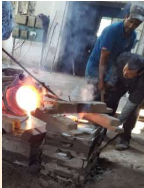
Fig. 4. Pouring of molten metal in moulds

2.5. Pouring of the mixture in the mould: After successful mixing of magnesium molten metal and fly ash cenosphers, the mixture is poured into the mould with the help of holding stands. Fig. 4. shows process of pouring of molted magnesium and fly ash in the mould.