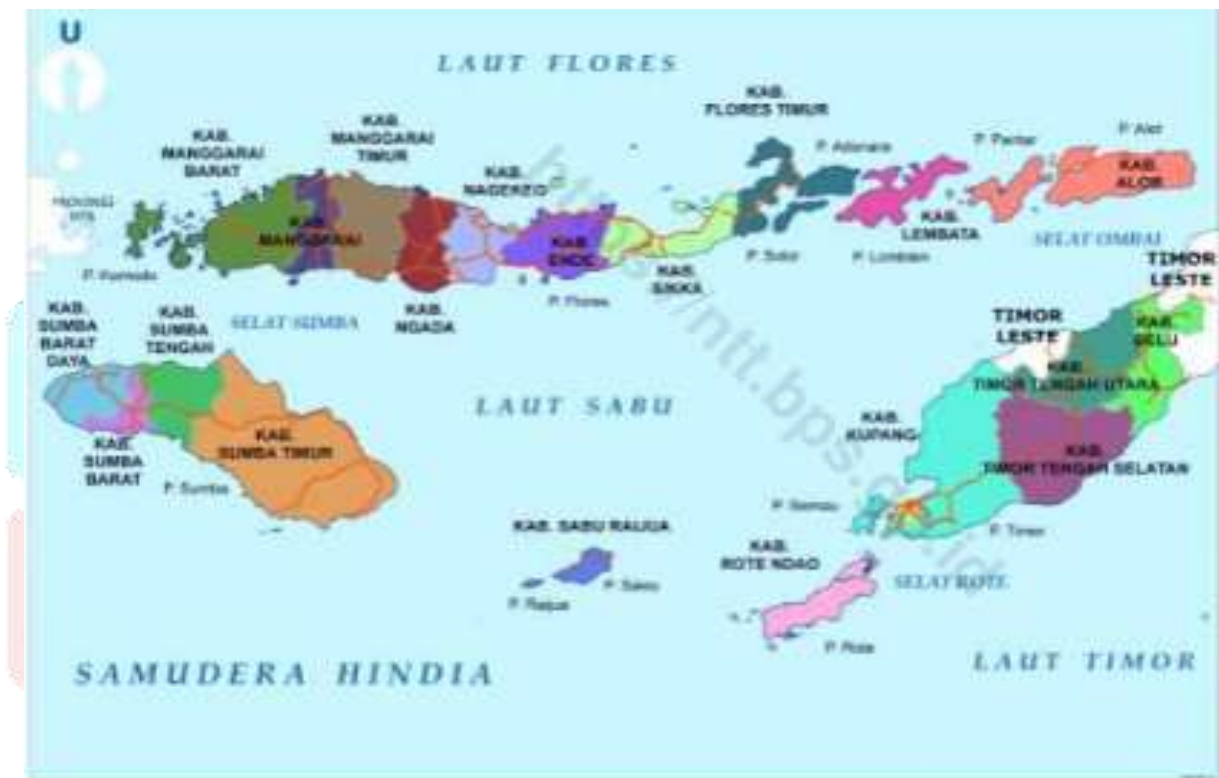
Figure 1. The map of Nusa Tenggara Timur province

The Nusa Tenggara Timur province is an archipelago province consisting of 1.192 islands, 432 of islands already have names, and the rest do not have names. 42 islands have been inhabited and 1.150 islands have not been inhabited. Among 432 of islands already have names, there are 3 (three) large islands namely Sumba island (the district of Sumba Barat, Sumba Timur, Sumba Tengah, and Sumba Barat Daya), Timor islands and its surroundings (Kota Kupang, the district of Kupang, Timor Tengah Selatan, Timor Tengah Utara, Belu, Malaka, Rote Ndao, Sabu Raijua), Flores island (the district of Flores Timur, Sikka, Ende, Ngada, Nagekeo, Manggarai, Manggarai Barat, Manggarai Timur, Lembata, dan Alor). To be more clear, can be seen in Figure 1 below.