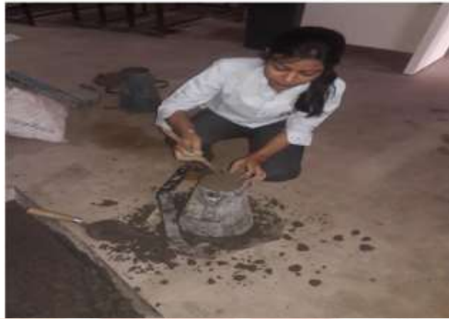
Fig(4)Lab work of Slump Cone Test