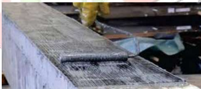
Figure (3) Use of Epoxy Adhesive

Epoxy is a common used for strong adhesives which are required to be used for bonding – two materials or surface together. Epoxy adhesives are usually two component systems I.e. two compounds ( resins) that need to be mixed together and cured either at room temperature or at elevated temperatures. Epoxies are created by polymerizing admixture of two starting compounds, the resin and the hardener. When resin is mixed with a specified catalyst, curing chains react at chemically active sites, resulting in an exothermic reaction. Covalent bond between the epoxy groups of the resin and the amine groups of the hardener (catalyst) that arise from this combination afford for the cross- linkage of the polymer, and thereby dictate the rigidity and strength of the epoxy. Epoxy adhesive generally used for coating; ex-coating of FRP on column or beams, now a day's a wide range of epoxy resins are produced initially. Epoxy provides the use of the strongest bond epoxies are known for their excellent adhesion, chemical and heat resistance and have very good structural insulating properties. As we can see in fig(3).