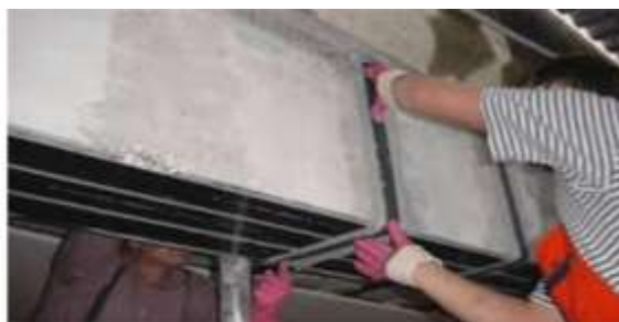
Figure (2) Use of FRP Sheet