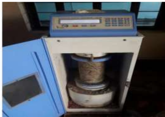
Fig(5)Lab work on Tensile Strength Test