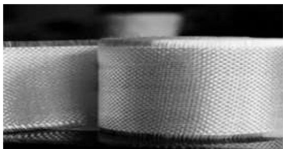
Figure (1) FRP Sheet