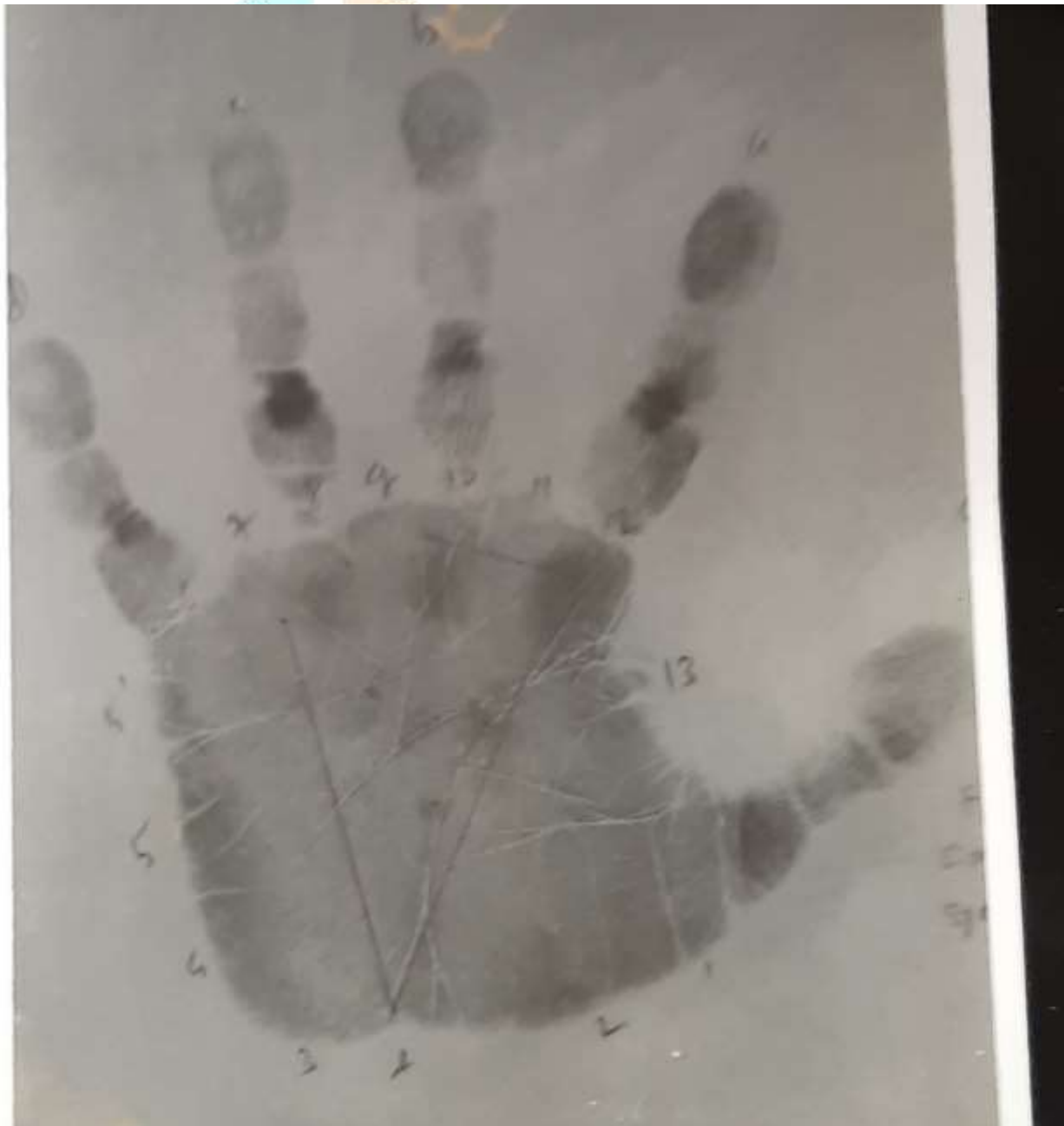
fig 2: dermatoglyphic palmprint showing axial tri-radius (denoted by 't', near the proximal margin of palm between 2 and 3)

In all categories frequency of 5 'tri-radii' was observed in majority of subjects. Variations from this, that is either 4 or 6 'tri-radii' was observed in extremely few cases.