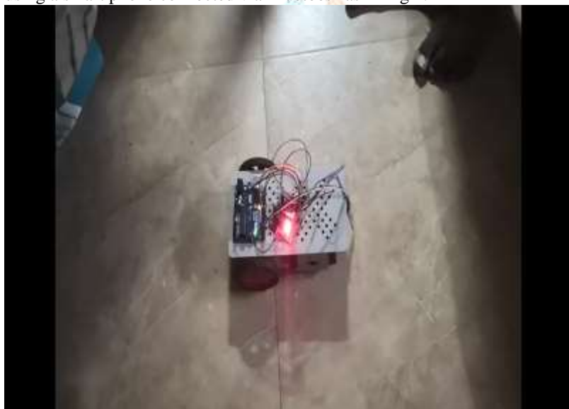
Fig. 1.1 Surveillance Robot Hardware

The project aims on analyzing and recognizing crops which have disease to do this, a surveillance robot is used to capture the live images of the leaves using ESP32 Camera Module as opposed to using a dataset. The robot will survey the field everyday which is operated using a smart phone connected via Bluetooth as in Fig 1.1