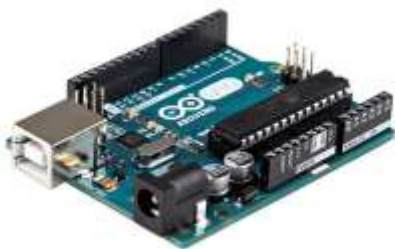
Fig. 3.1 Arduino UNO

Arduino UNO is an open-source microcontroller which is developed for experimental purposes which is based on Atmega328. Open source refers that the boards and software which are available where anyone can modify it and use it for testing on any specific application without the need of starting from scratch