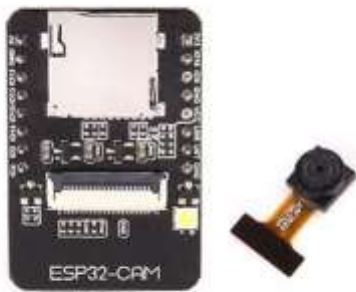
Fig. 3.4 ESP32 Camera Module

The ESP32 module comes with ESP32-S chip and a small size ov070 camera with a micro SD card slot. The micro SD card slot can be used to store images taken from the camera which is with the module or to store some other required files in it. This module can be widely used in various IoT applications. It can be used as a face detection system in offices, schools and other private areas where wireless monitoring is required.