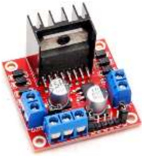
Fig. 3.3 L298 Motor Driver

L298 Motor Driver is a high voltage and high current motor drive chip which is a dual H-Bridge motor driver. It allows speed and direction control of two DC motors at the same time. The module can drive DC motors easily with peak current up to 2A. A 12V power supply is required to run the motor driver. This is used since microcontrollers cannot directly run motors, thus making it easy for microcontrollers to control the motors which are connected to it.