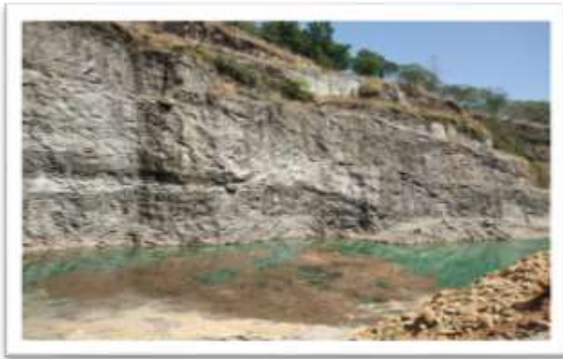
Fig. 1 Selected Quarry Site