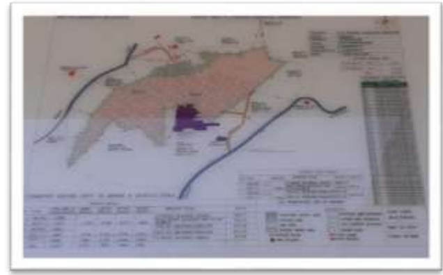
Fig. 2 Survey Map of Quarry