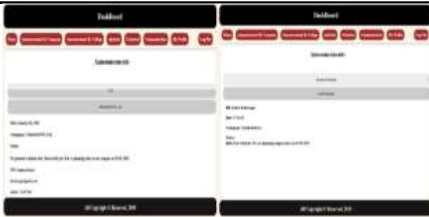
Fig.6.4. Campus Announcement

Fig.6.4 Here student can be able to view details about campus drive send by company or T&P of other colleges.