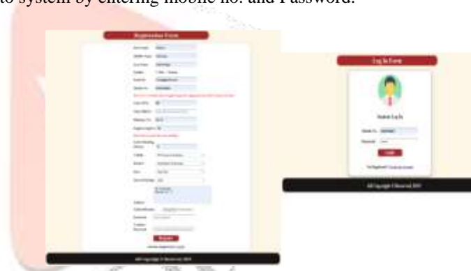
Fig.6.2. Registration and Login Page

Fig. 6.3 is of Student Home Page, after login Student will be directed to the home page where system will greet them and student can go to other tabs by clicking on them.