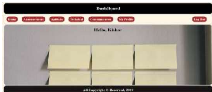
Fig.6.3. Student Homepage

Figure 6.2 shows registration and login page. If the students haven't registered they can register by clicking on the Create an Account. Once the students enter the academic and personal details in the registration page, all the details will be stored in the database and after registration student can log in into system by entering mobile no. and Password.