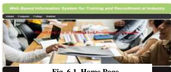
Fig. 6.1. Home Page

Snapshot of designed system is given below which shows interface of various modules of system along with their Functionalities.