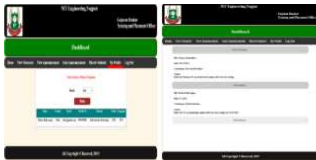
6.6 View placed Student and View vacancies

The fig.6.6. Shows T&P of the college who can see the list of placed student as well as opening vacancies provided by the company which can be sharable with student as well as other colleges. Company can send the drive details to student, college or both, as shown by the fig.6.7.