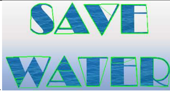
Fig.3: MSER regions in image.