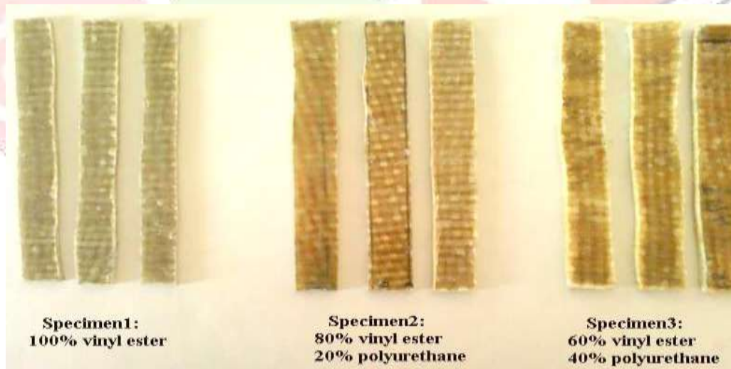
Figure 1 Standard Specimen modals

The process of forming an uncured thermo set resins, then completing the curing after the article has been removed from its forming mold or mandrel.