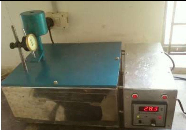
Figure 2 Experimental setup