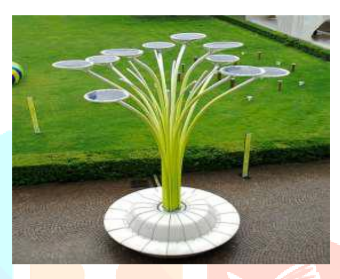
Figure 3 Artistic design solar tree

The panels will be naturally facing towards the sun at an angle as required so that they can collect maximum solar energy in a daytime. These solar trees can be mounted anywhere .like terrace or anywhere near the house, roadsides, in between wide roads / highways, on boundary walls.Maintenance and dust cleaning is also not a big issue. [16]