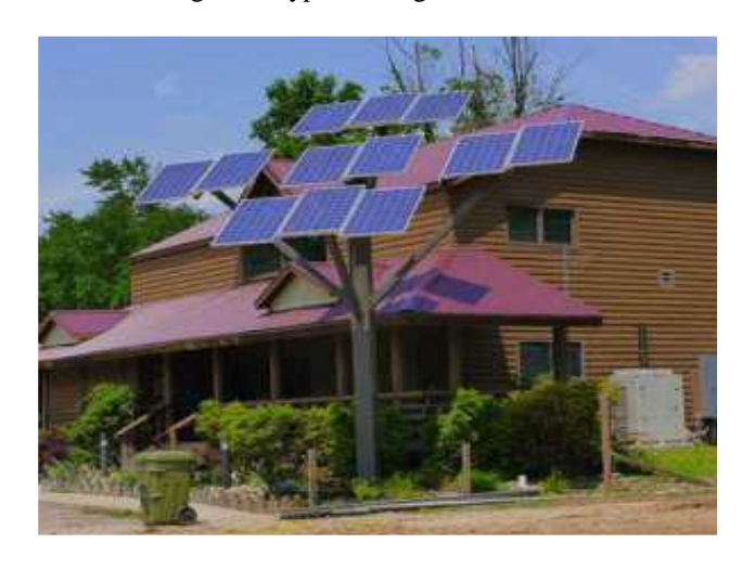
Figure 5 Mounting of Solar Tree near the house