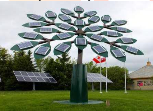
Figure 4 Typical design of solar tree