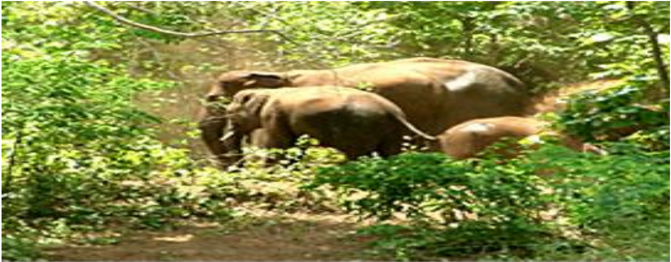
Elephants in Ushakothi Wildlife Sanctaury

Ushakothi Wildlife Sanctuary, also known as Badrama Sanctuary, is a popular wildlife sanctuary situated 45 km north-east of Sambalpur, on the National Highway number 53.