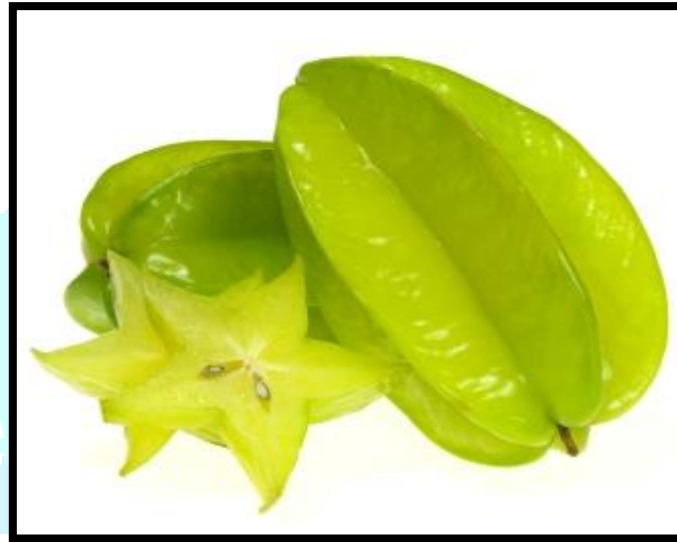
Figure 2. Illustration of Carambola fruit

In India, it is commonly found in warmer regions like southern states and along the west coast and extends from Kerala up to West Bengal. The fruit is about 2 to 6 inches in length. Here exist two distinct classes of Carambola, the Smaller with sour taste and the Larger with sweet taste. The word carambola originates from a Sanskrit word "Karmaranga" meaning "food appetizer" (Kumar Hitesh and Arora Tejpal, 2016). The Starfruit believed to thrive up to 4,000 feet which accounts to about 1,200 m. When small, the fruit is green in color but when ripe it turns yellow. It is fleshy, five lobed, ovate to ellipsoid ranging from 5 – 8 cm long and 9 cm wider. It stays fragile and are susceptible to wind scarring when grows on tree. The fruit is crunchy with slight acidic and sweet taste and very juicy in nature (Gheewala Payal et.al, 2012). (Figure 2. Illustrates the carambola fruit).