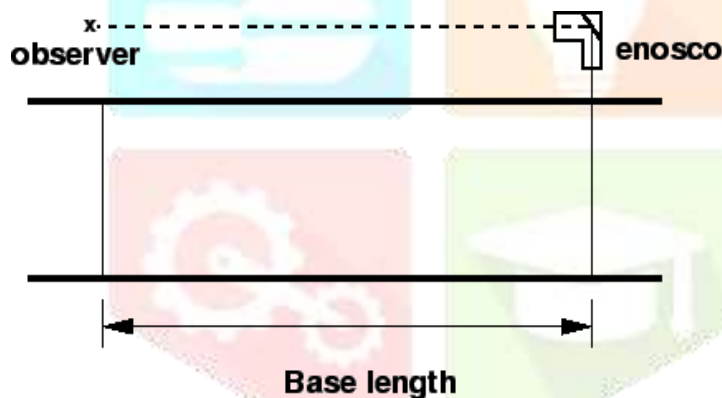
FIG.SPOT SPEED BY ENOSCOPE

One of the simplest methods of finding spot speed is by using enoscope which is just a mirror box supported on a tripod stand. In its simplest principle, the observer is stationed on one side of the road and starts a stopwatch when a vehicle crosses that section. An enoscope is placed at a convenient distance of say 30 m. in such a way that the image of the vehicle is seen by the observer when the vehicle crosses the section where the enoscope is fixed.