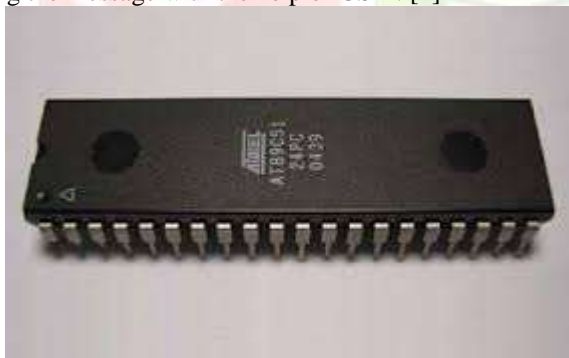
Fig. 3 Microcontroller

Microcontroller- For this system we use 8051 Microcontroller because it is inexpensive, low-power, high-performance CMOS 8-bit microcontroller with 4K bytes of In-System Programmable Flash memory. There are 131 powerful instructions present in ATmega16. Most of single clock cycle execution and 32*8 general purpose working register, fully static operation. [2] The micro-controller is used in system for controlling purpose and sending the message with the help of GSM. [2]