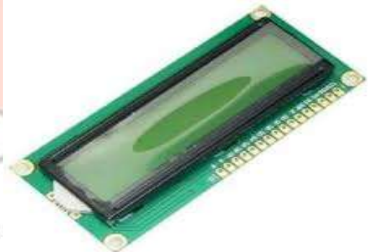
Fig. 5 LCD display

LCD Display- LCDs (Liquid Crystal Displays) are used for displaying status or parameters in embedded systems. LCD 16x2 is 16 pin device which has 8 data pins (D0-D7) and 3 control pins (RS, RW, EN). The remaining 5 pins are for supply and backlight for the LCD. The control pins help us configure the LCD in command mode or data mode. They also help configure read mode or write mode and also when to read or write. LCD 16x2 can be used in 4-bit mode or 8-bit mode depending on the requirement of the application. In order to use it we need to send certain commands to the LCD in command mode and once the LCD is configured according to our need, we can send the required data in data mode to display on it. For this system LCD Display is use for showing output and it is mounted outside the suitcase.