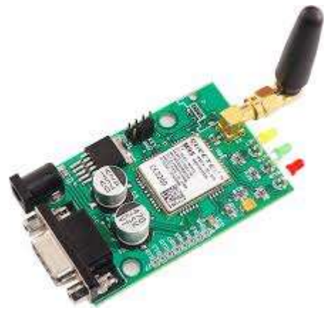
Fig. 4 GSM module

GSM Module- This GSM Modem can accept any GSM network operator SIM card and act just like a mobile phone with its own unique phone number. Advantage of using this modem will be that you can use its RS232 port to communicate and develop embedded applications. It can be used to send and receive SMS. This GSM modem is a highly flexible plug and play quad band GSM modem for direct and easy integration to RS232 applications. Supports features like Voice, SMS, GPRS. [2] In this system we will use GSM module is to send an SMS to sender's mobile for feedback.