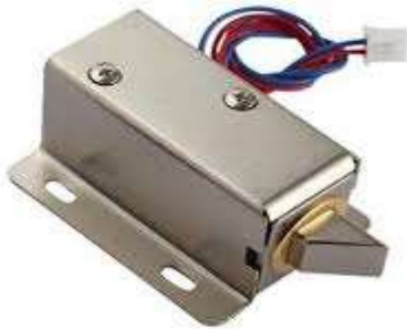
Fig. 7 Electronic Lock

Electronic Lock- Electronic lock has a slug with a slanted cut and a good mounting bracket. It's basically an electronic lock, designed for a basic cabinet or safe or door. Normally the lock is active so you can't open the door because the solenoid slug is in the way. It does not use any power in this state. When 9-12VDC is applied, the slug pulls in so it doesn't stick out anymore and the door can be opened. For this system we required electronic lock is to open the suitcase after correct password and call verification.