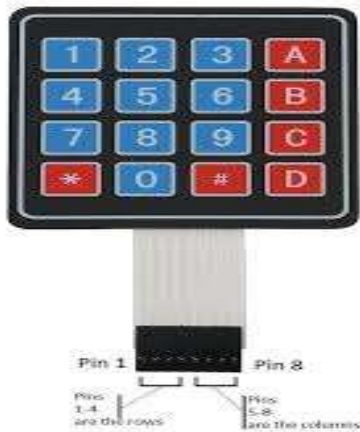
Fig. 6 Keypad

Electronic Lock- Electronic lock has a slug with a slanted cut and a good mounting bracket. It's basically an electronic lock, designed for a basic cabinet or safe or door. Normally the lock is active so you can't open the door because the solenoid slug is in the way. It does not use any power in this state. When 9-12VDC is applied, the slug pulls in so it doesn't stick out anymore and the door can be opened. For this system we required electronic lock is to open the suitcase after correct password and call verification.