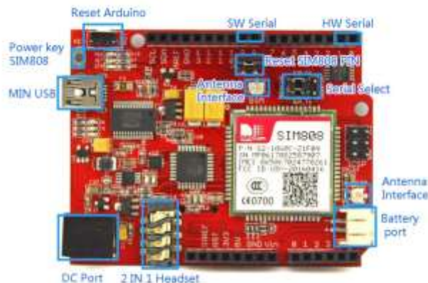
Fig. SIMduino V2

The Electrow Simduino combines Arduino uno and sim808 module. It will save more cost and space for your project and easier to build other modules. It not only by DC power supply, we have designed a battery interface for it, you can also use a 3.7V lithium battery to power it. Whether you want to get a Arduino or a SIM808 module, even start a SIM808 related application that base on Arduino. It will make your satisfaction. Come on and add it to your shopping cart.