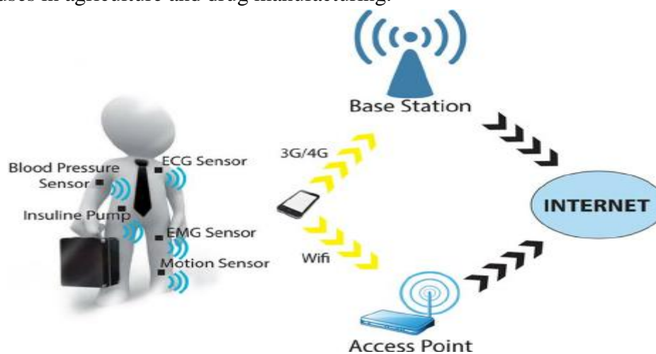
Fig 2: Molecular transceivers

Molecular transceivers will be easy to integrate in Nano-devices due to their size and domain of operation. These transceivers are able to react to specific molecules and to release others as a response after performing some type of processing. Recent advancements in molecular and carbon electronics have applied a new generation of electronic Nano-components such as Nano batteries, Nano-memories, logical circuitry in the nanoscale and even Nano-antennas. Some of the most advanced nanosensors to date have been crafted by using the tools of synthetic biology to modify single-celled organisms, such as bacteria[3,4]. The goal here is to fashion simple biocomputers that use DNA and proteins to recognize specific chemical targets, store a few bits of information, and then report their status by changing color or emitting some other easily detectable signal. Synlogic, a start-up in Cambridge, Mass., is working to commercialize computationally enabled strains of probiotic bacteria to treat rare metabolic disorders. Beyond medicine, such cellular nanosensors could find many uses in agriculture and drug manufacturing.