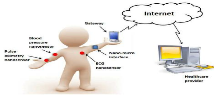
Fig1: IoT based wireless communication

As shown in fig1. The explosion of connected items, especially those monitored and controlled by artificial intelligence systems, can endow ordinary things with amazing capabilities—a house that unlocks the front door when it recognizes its owner arriving home from work, for example, or an implanted heart monitor that calls the doctor if the organ shows signs of failing. But the real Big Bang in the online universe may lie just ahead[2]. Scientists have started shrinking sensors from millimeters or microns in size to the nanometer scale, small enough to circulate within living bodies and to mix directly into construction materials. This is a crucial first step toward an Internet of Nano Things (IoNT) that could take medicine, energy efficiency and many other sectors to a whole new dimension.