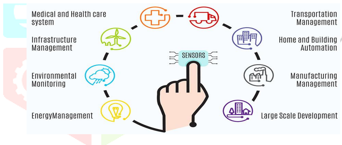
Fig 3: Nano Technology everyday intelligent environments

Nanotechnology was first developed in 1965, it consists of the processing of, separation, consolidation, and deformation of materials by one atom or by one molecule[6]. It's fabrication of devices in a scale ranging from 1 to 100 nanometers. Nanotechnology will enable manufacturers to produce computer chips and sensors that are considerably smaller, faster, more energy efficient, and cheaper to manufacture than their present-day counterparts .Micromechanical sensors also became an elementary part of automotive technologies in mid-1990, roughly ten years later more miniaturized micromechanical sensors are enabling novel features for consumer electronics and mobile devices. Within the next ten years the development of truly embedded sensors based on nanostructures will become a part of our everyday intelligent environments as shown in fig3.