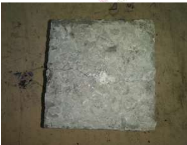
Figure 3: Concrete cube after hairline fracture

The cube mould for each grade of concrete and containing different percentages of bacteria was loaded through Compression Testing Machine until the hairline fracture as shown in Fig. 3 was obtained on the surface of the concrete. The cube was further covered with moisture content jute bag for 30 to 40 days at room temperature for self-healing. After a span of 30-40 days, when the self-healing of the concrete was over, the compressive strength of concrete was further obtained through Compression Testing Machine. The concrete cube after self-healing is shown in Fig. 4.