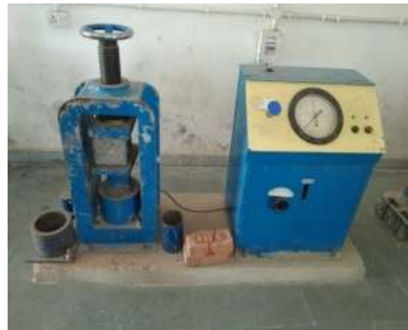
Figure 2: Compressive testing machine

The cube mould for each grade of concrete and containing different percentages of bacteria was loaded through Compression Testing Machine until the hairline fracture as shown in Fig. 3 was obtained on the surface of the concrete. The cube was further covered with moisture content jute bag for 30 to 40 days at room temperature for self-healing. After a span of 30-40 days, when the self-healing of the concrete was over, the compressive strength of concrete was further obtained through Compression Testing Machine. The concrete cube after self-healing is shown in Fig. 4.