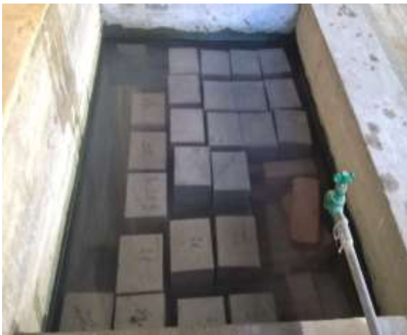
Figure 1: Curing of specimen

The aim of the present study was to study the effect of Bacillus subtilis on compressive strength of concrete by partial replacement of water with 0%, 2.5%, 5% and 10% of B. subtilis in cultured form. The concrete mix of M20, M25 and M30 grade was prepared as per IS10262:2009 having mix ratio as 1:1.5:3, 1:1:2 and 1:1:3 respectively with w/c ratio of 0.55, 0.45 and 0.40. To carry out the experimental investigation total 36 cubes of size 150mm x 150mm x 150mm were casted. 9 cubes were casted to determine the compressive strength of normal concrete with no bacteria. Similarly, each set of 9 cubes were casted to determine the compressive strength for 2.5%, 5% and 10% replacement of water with bacillus subtilis respectively. From these 9 cubes, each set of 3 cubes were utilized to determine the compressive strength of concrete after 7 days, 14 days and 28 days of curing as shown in Fig. 1. Compression Testing Machine of 2000kN capacity as shown in Fig. 2 was used to determine the total compressive load taken by concrete at different ages. This ultimate load divided by the cross-sectional area of the cube (150mm x 150mm) yields the compressive strength of concrete.