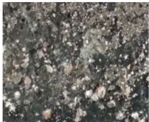
Figure 4: Concrete cube after self-healing