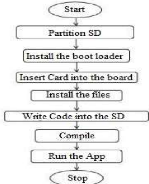
Fig.3 Installation Process

The following figure shows the Architectural flow of the system. Using this algorithm, a system can be created to prevent theft.