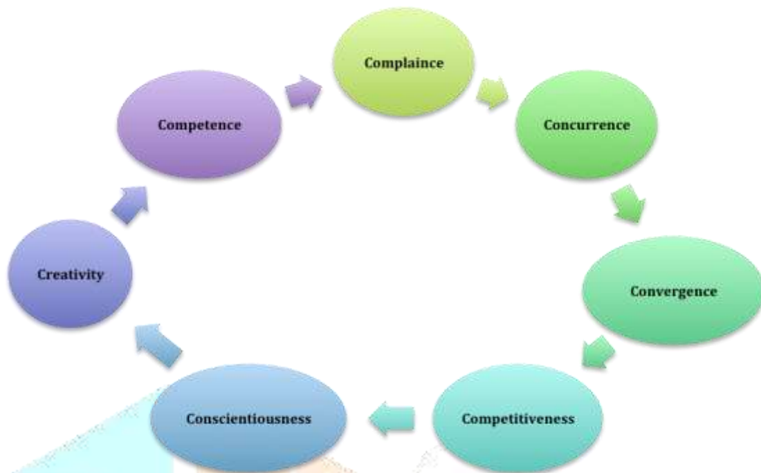
Fig.2: Seven Cs of teaching pedagogy