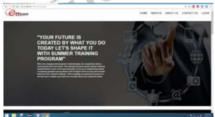
Fig 1.1 Homepage