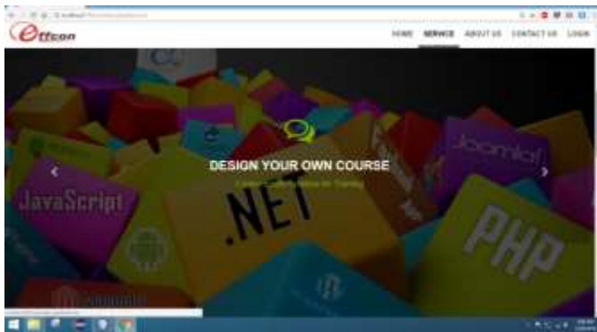
Fig 1.2 Services page