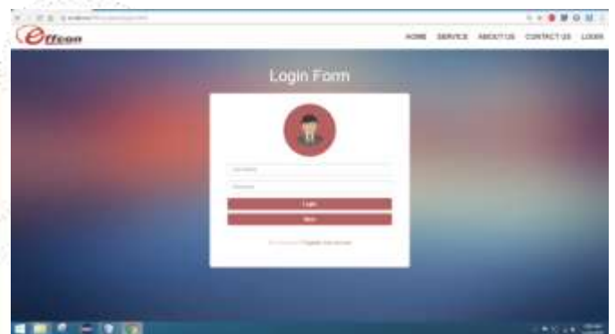
Fig 1.4 Log in page

The above is contact us page through which a user can get in touch by visiting or by contacting the organization. Map has also been shown that directs to Google map.