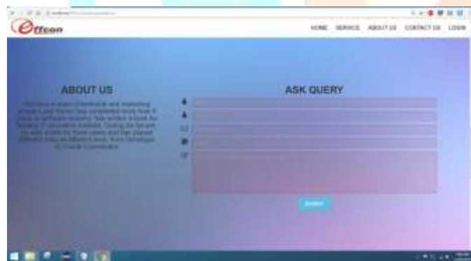
Fig 1.3 About us Page

The following is the second page of the website known as services page. This page acknowledge the user about the website and the services it provide, user can easily get an idea about the courses.