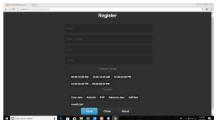
Fig 1.5 Register Page

The above is log in page in which either admin or user can log in by entering his/her user name and password . Along with it, this page has ' register your account ' section which directs to the register page.