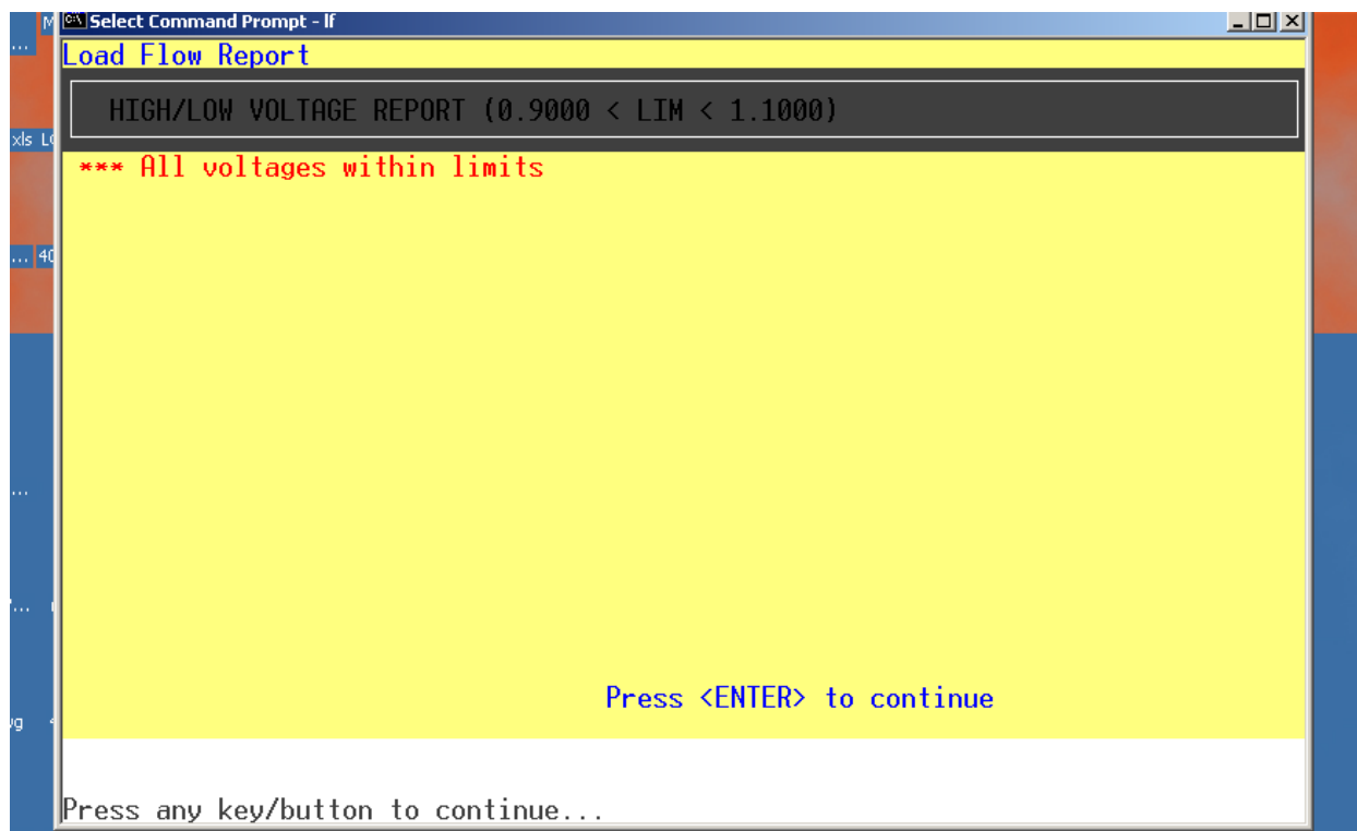
Fig. 3. Voltage report from the load flow studies after carrying out the reactive compensation

With this capacitive compensation it is found that the low voltages which were incident at some of the highly loaded buses were found improved as shown in the table (III) and the voltages are observed with in the required margins, even after the disturbance, as per the load flow report shown in fig (5).