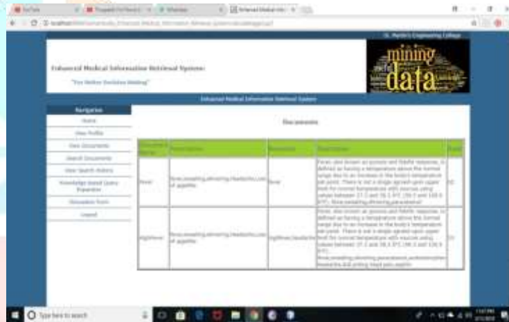
Fig. 4 Screen shot of the proposed system