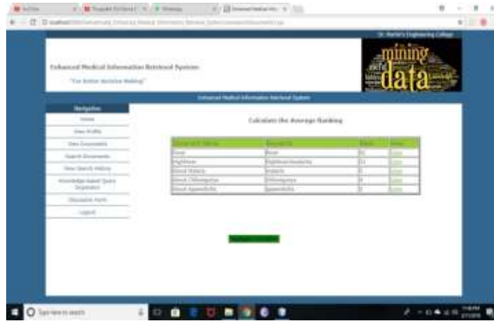
Fig. 3 Screen shot of the proposed system