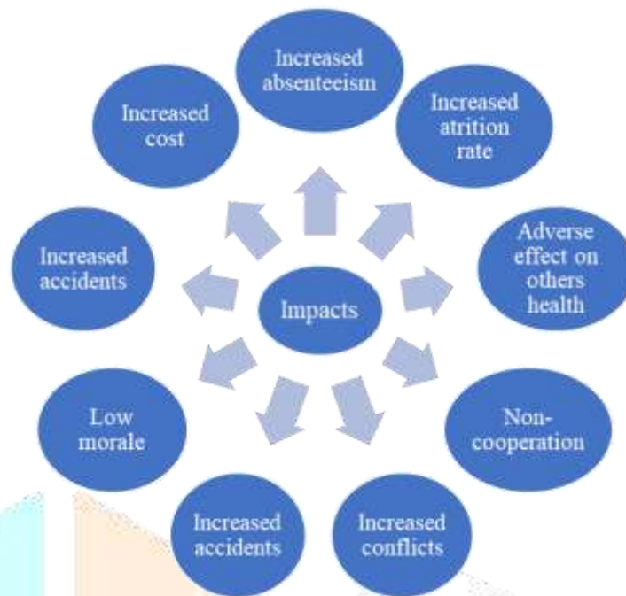
Figure 2: showing the impacts of lifestyle disorder