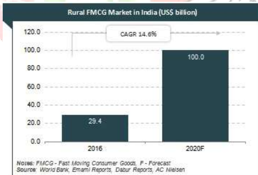
Figure no. 1 showing the Rural FMCG Market in India

The figure depicts the growth of rural FMCG market in India and is expected to reach US$ 100 billion in the year 2020.