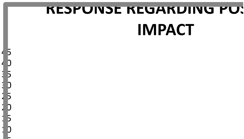
Fig 3.1: RESPONSE REGARDING POSITIVE IMPACT

Interpretation:By seeing the data, I can say that 55% employees are agree with the statement i.e. Positive impact of demonetization over banking sector. Whereas only 9% and 10% employees are seeing negativity in this step by giving the opinion respectively highly disagree and disagree.