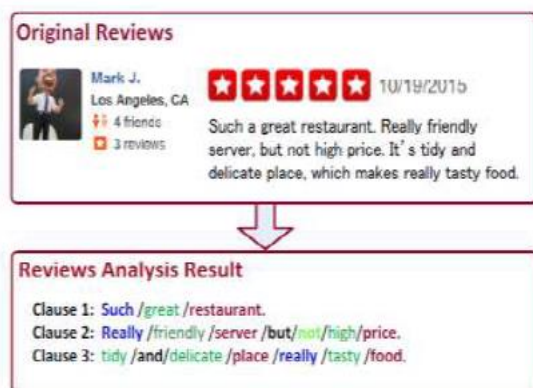
Fig. 3. An example of review analysis for identifying user's sentiment.