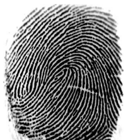
Figure.1: Fingerprint Images

Pattern vectors, represented as x = [x_1, x_2, \dots, x_n] , encapsulate each component ( x_i ) denoting the i th descriptor, and n represents the total number of descriptors associated with the pattern. The nature of these components in a pattern vector depends on the chosen approach to describe the physical entity itself. In the realm of fingerprint recognition, the interrelationships of print features, known as minutiae, form the basis for this arrangement, as illustrated in Figure 1 below.