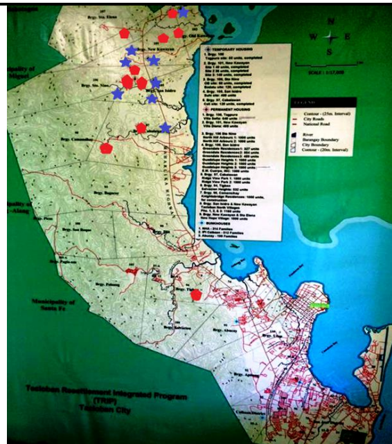
Legend: ★ Temporary Shelters Permanent Shelters