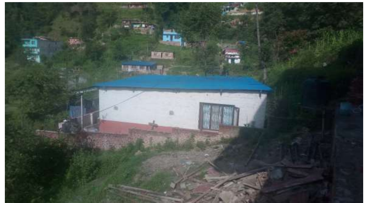
Fig: BMC Houses