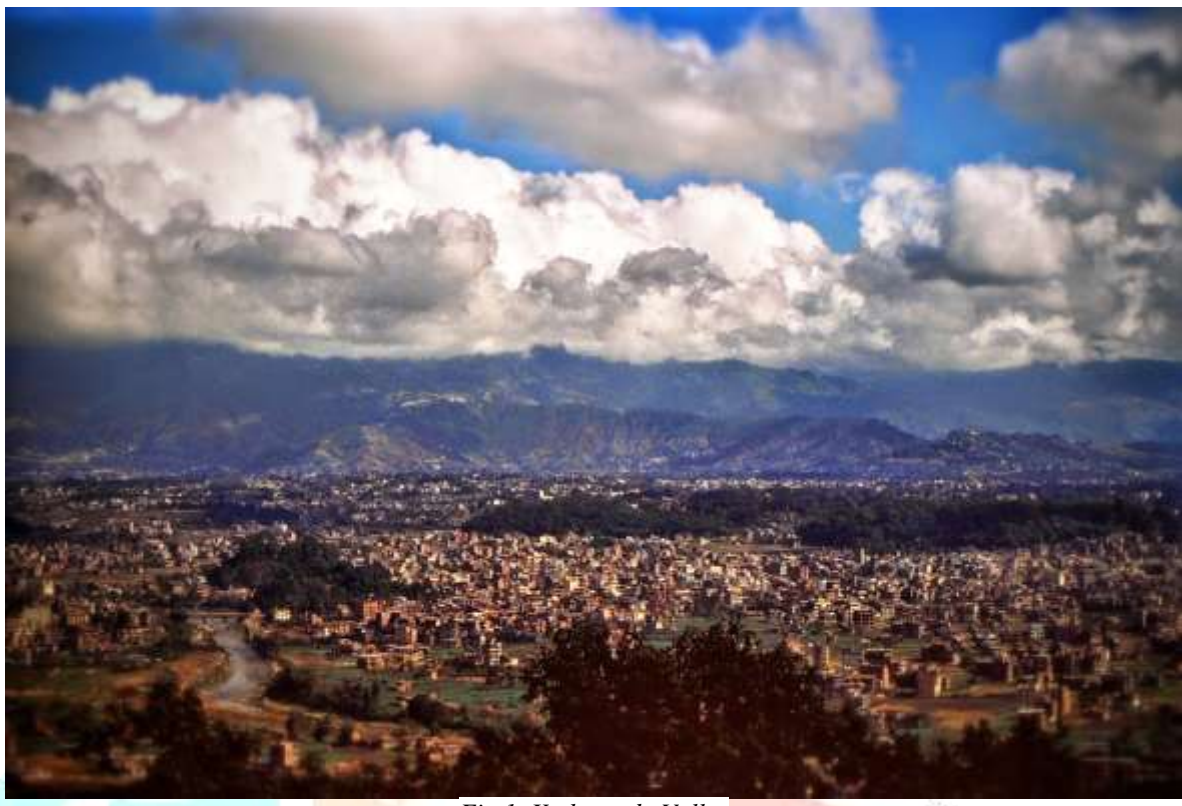
Fig 1. Kathmandu Valley