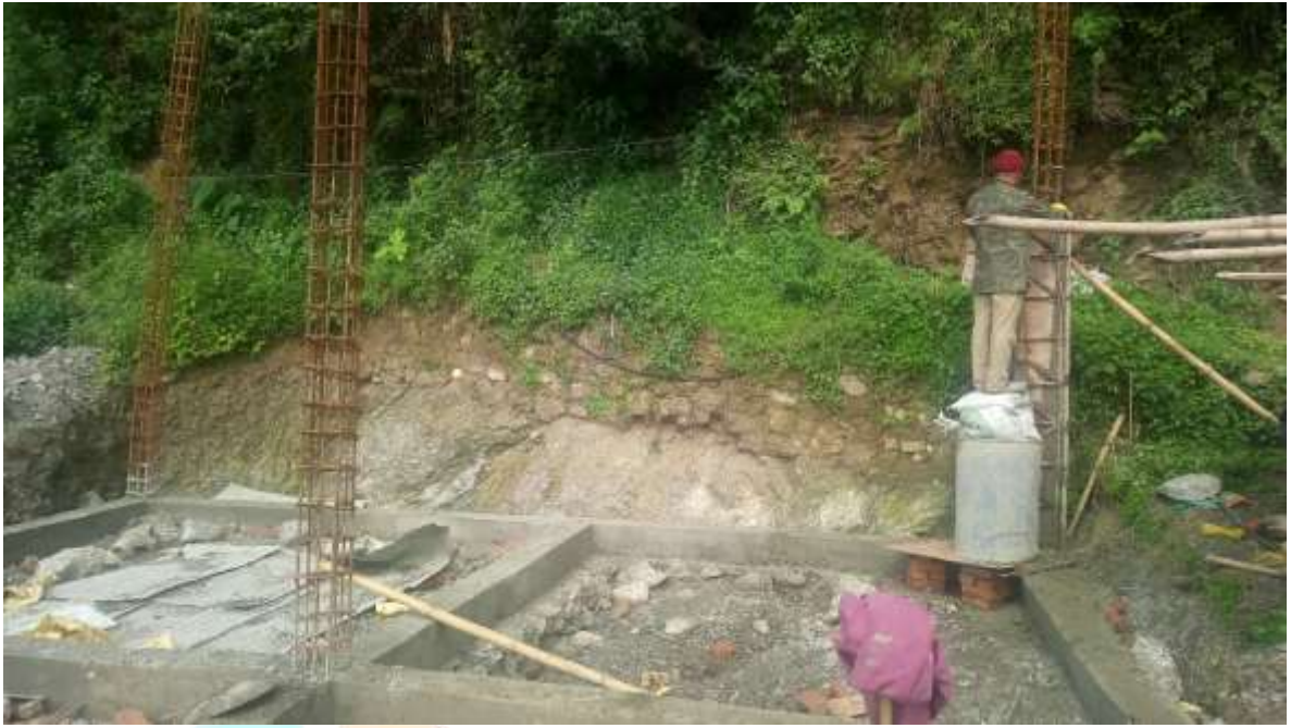
Fig: Construction Malpractice