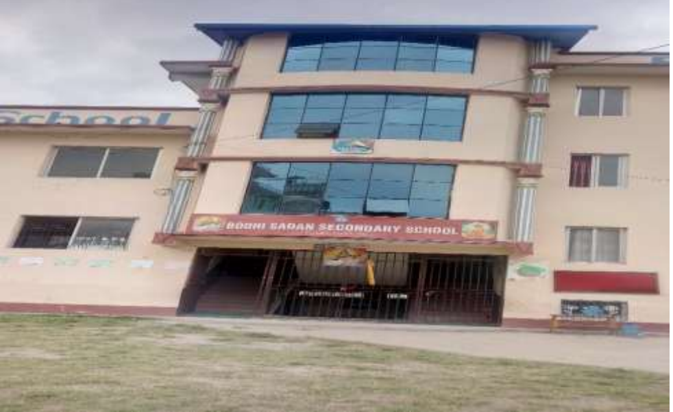
Fig 9 : School at Budhanilkantha

Public buildings include Schools, Government offices, hospitals etc. I personally had screening on different schools where the density of student per building was found to be very high. Few schools were found to be seismically safe where some were found to be vulnerable.