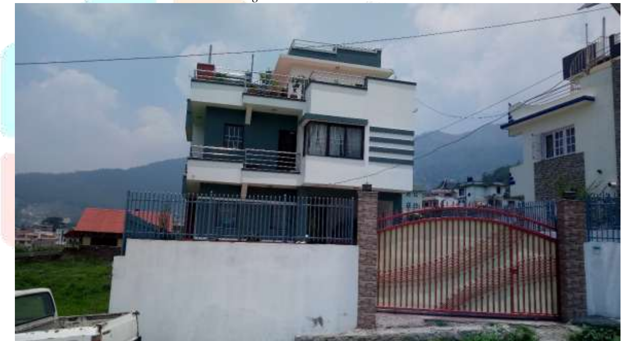
Fig: Recently constructed House