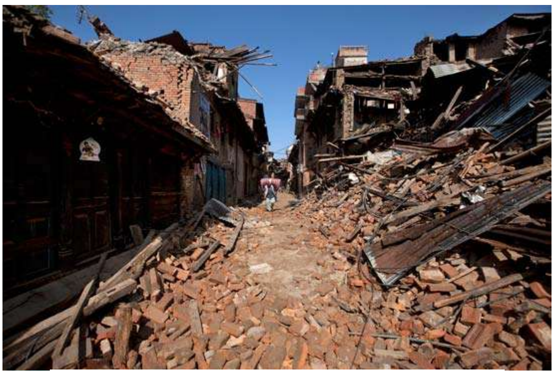
Fig 4: Destruction on Residential Buildings due to Earthquake at Kathmandu Region