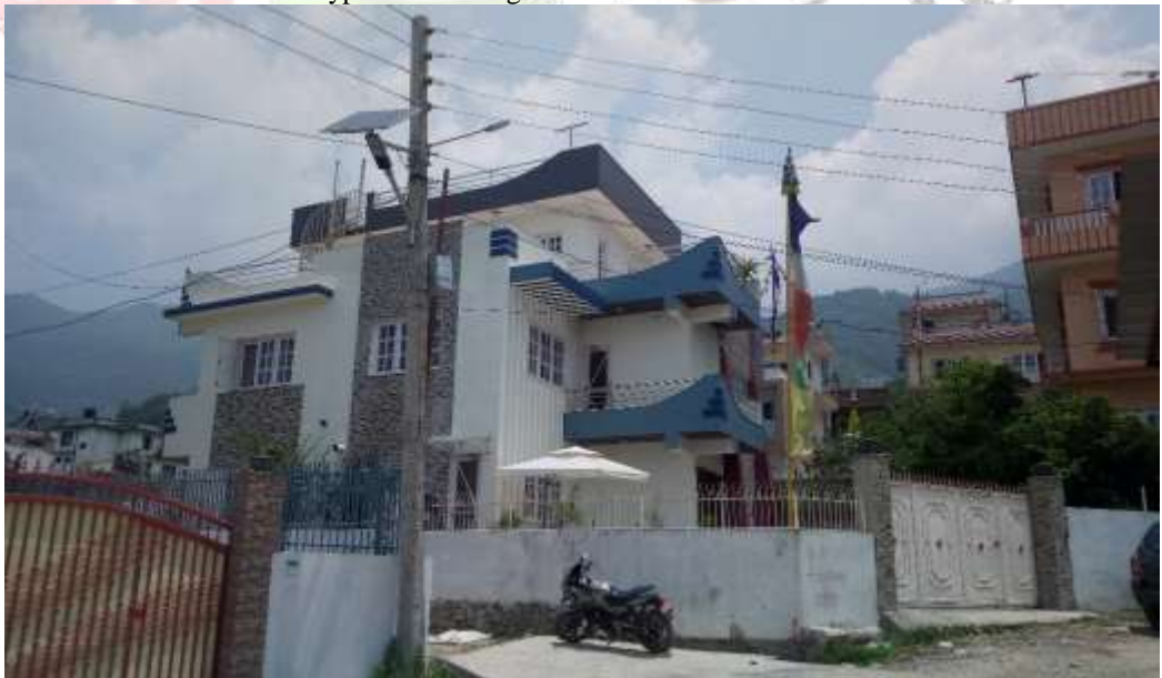
Fig 9: Recently Constructed House at Budhanilkantha

The common problem is same on Both the types of buildings RCC and BMC.