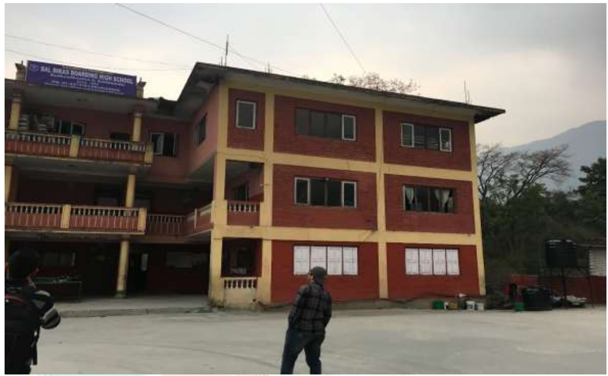
Fig: Evaluation of School