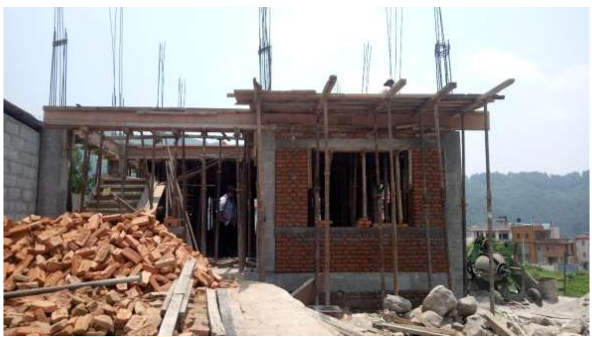
Fig: House under construction at Budhanilkantha