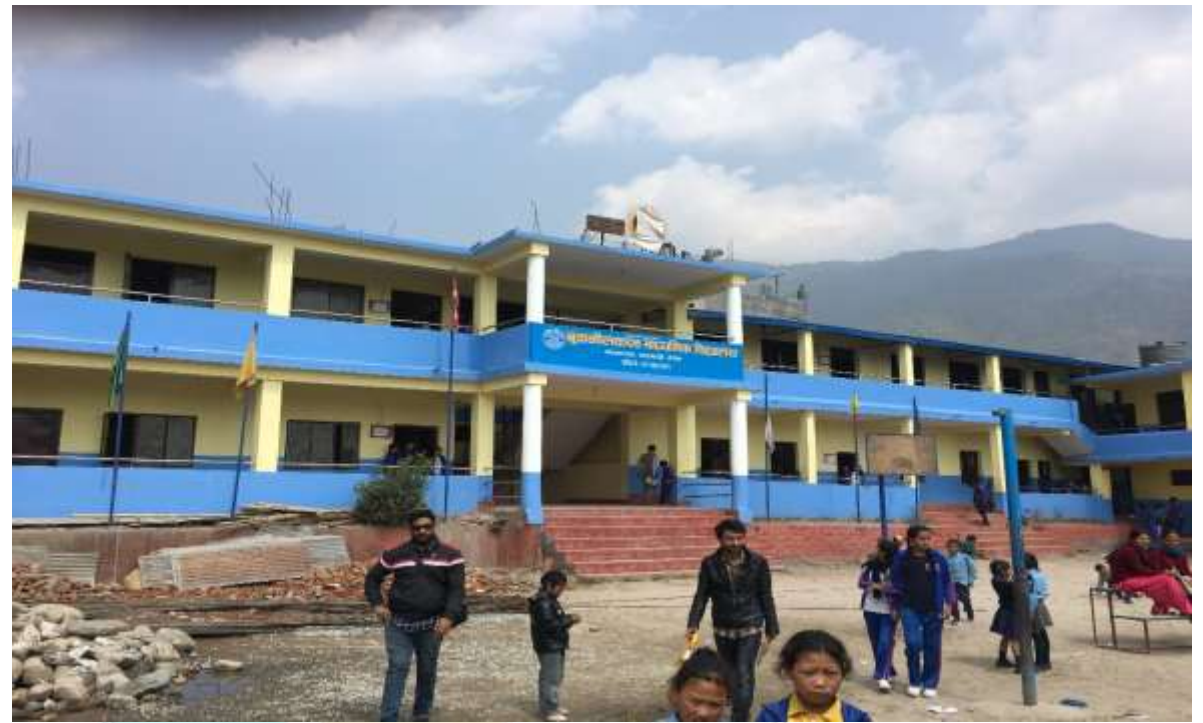
Fig: Screening at Public School