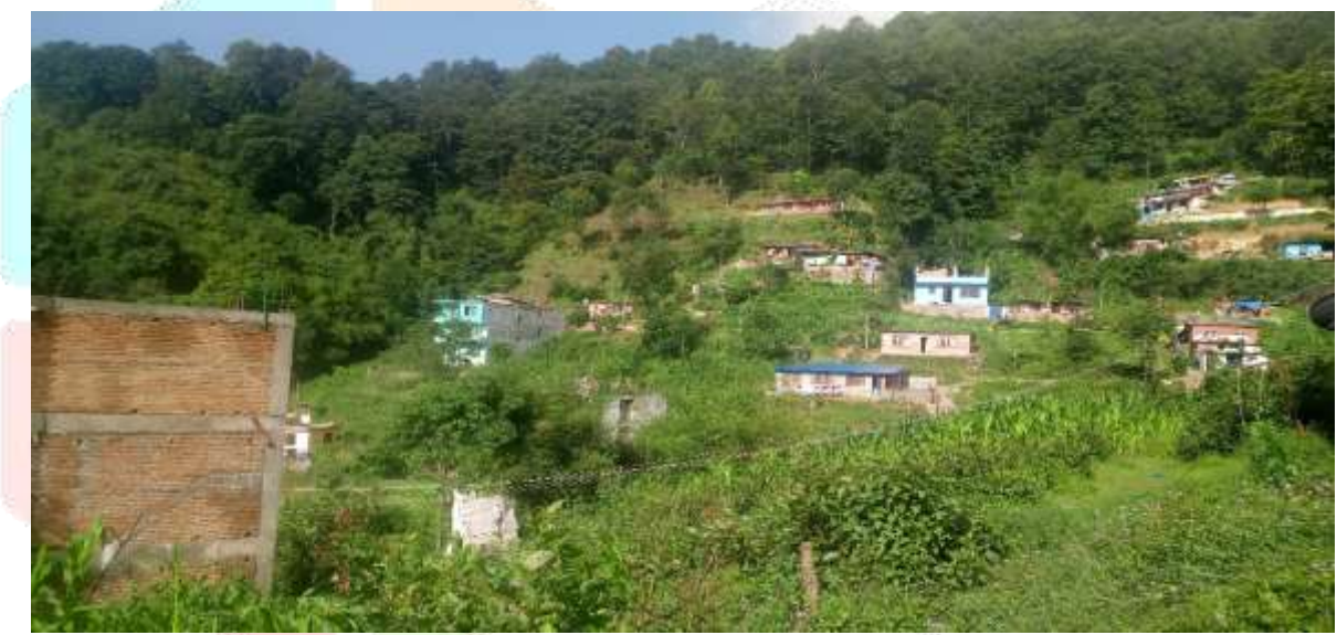
Fig: Part of Budhanilkantha Area