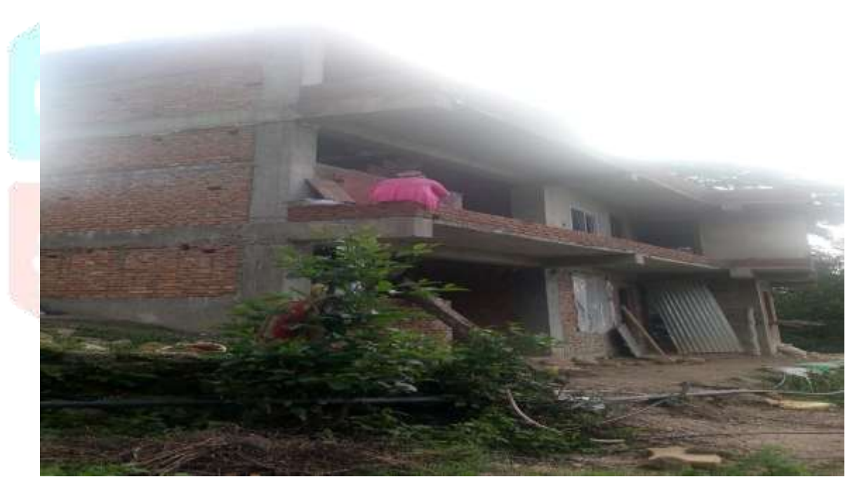
Fig: Plan Irregularity