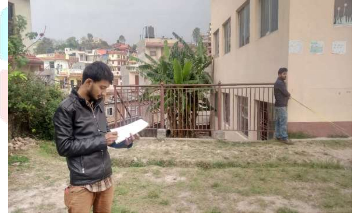
Fig: Screening at School