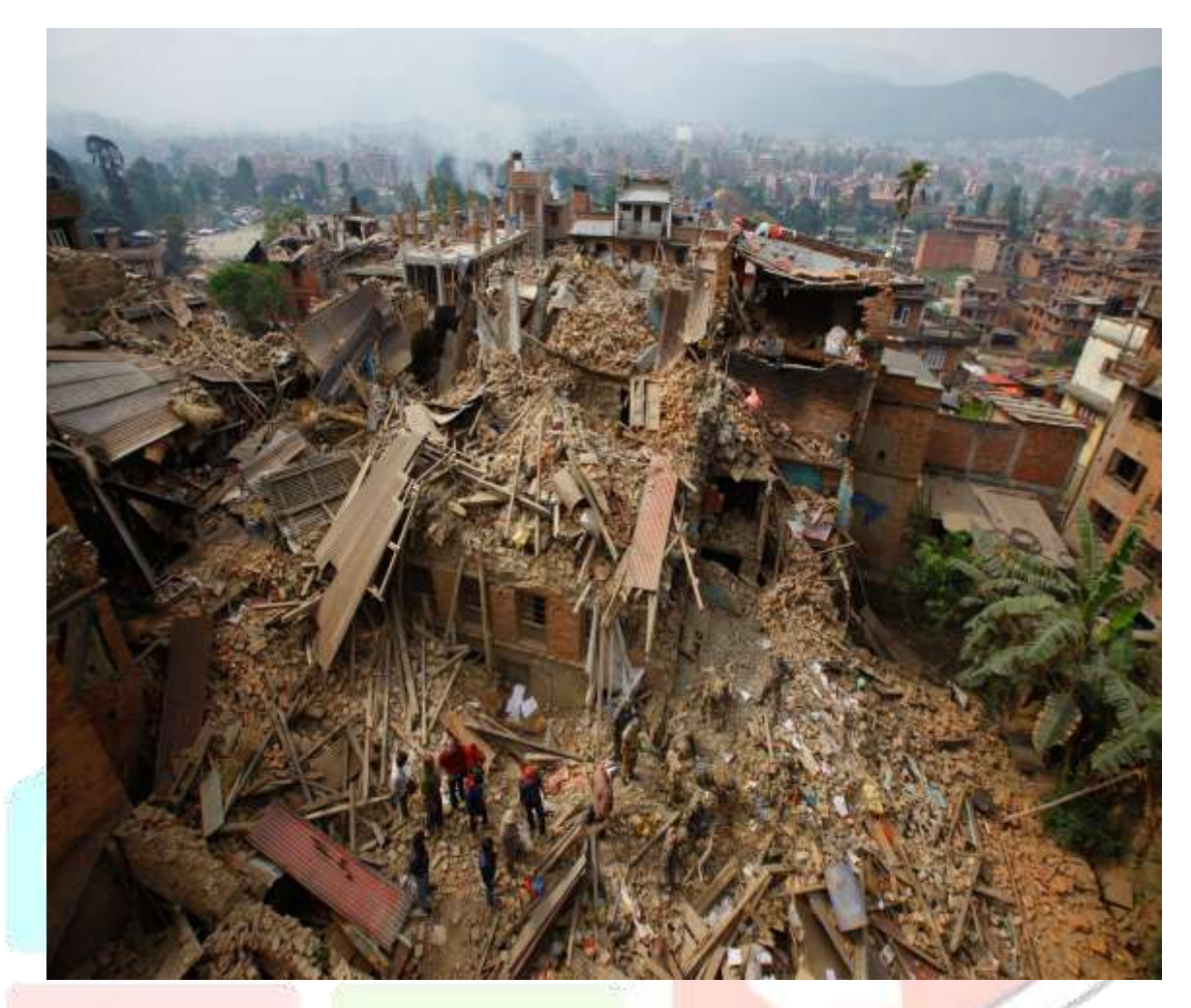
Fig 2: Destruction on Property due to Earthquake at Kathmandu Region