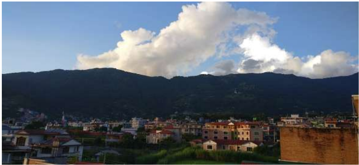
Fig 5: Budhanilkantha Locality resting on Shivapuri Hill