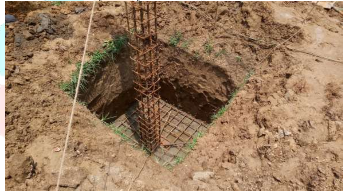
Fig: Foundation and Column Layout