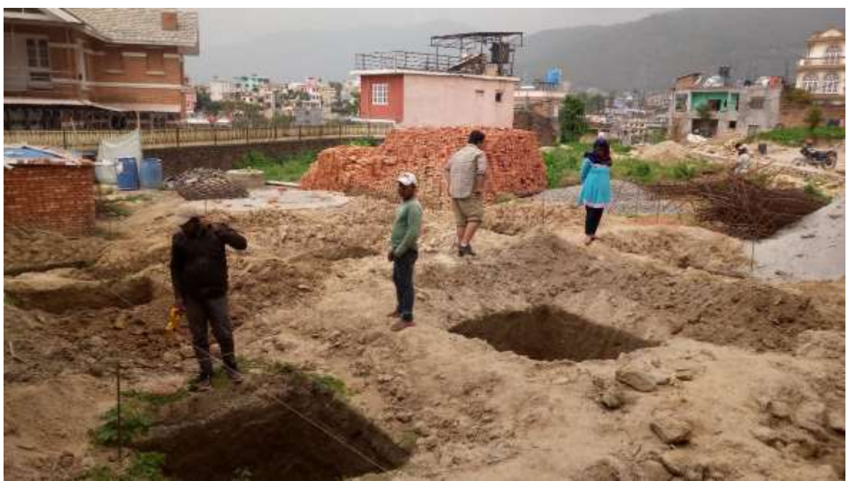
Fig: Well Designed House and Construction Practise