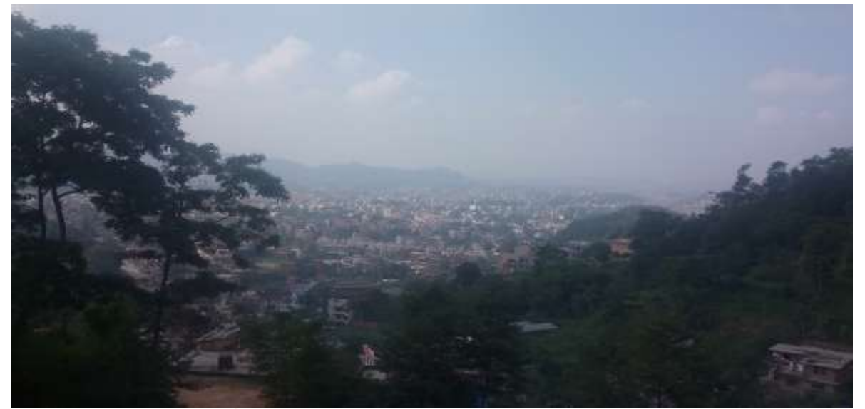
Fig: Part of Budhanilkantha area