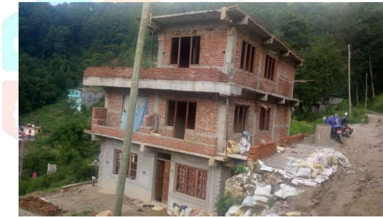
Fig: House under construction