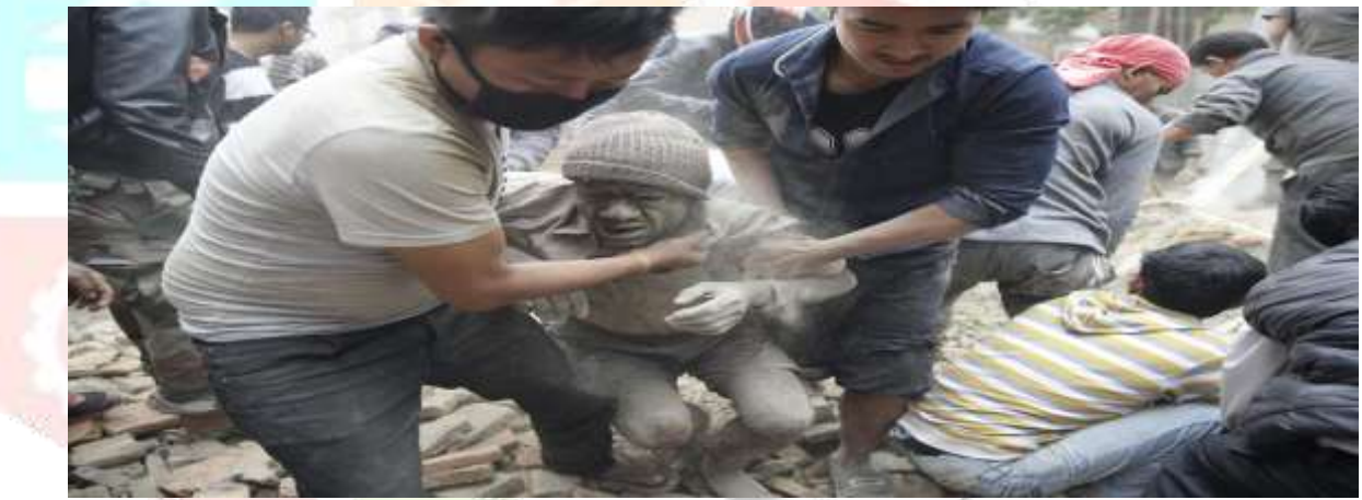
Fig 4: Casualty on Human Life due to Earthquake at Kathmandu Region