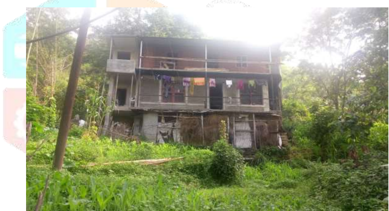
Fig: Hybrid Structure