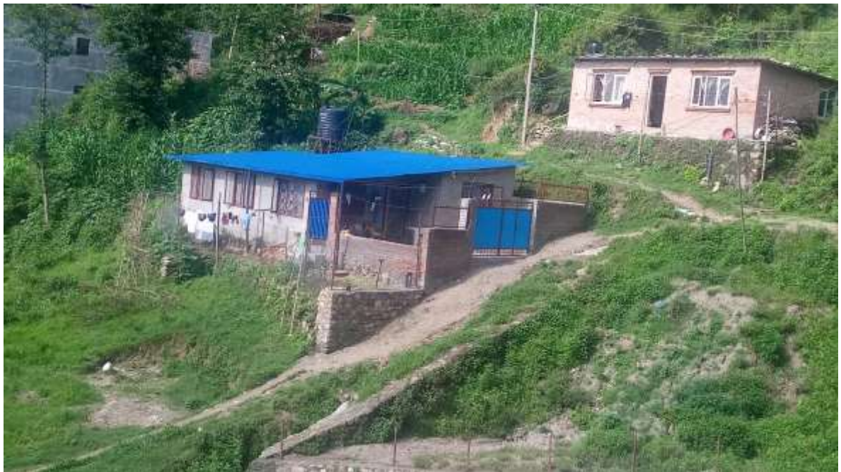
Fig: BMC House with Truss