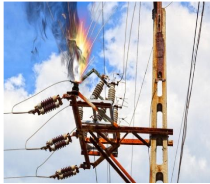
Fig. 1. Electrical faults in power systems

A short circuit can be defined as abnormal connection of very low impedance between two points of different potential . and it is also called as shunt faults.