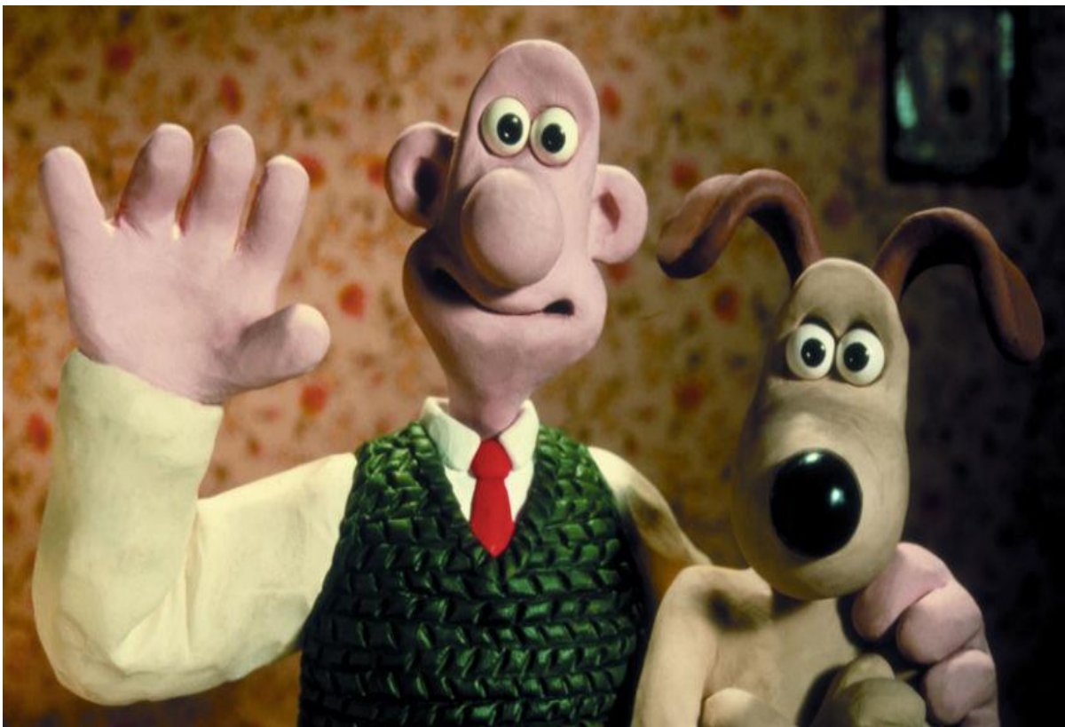
Figure 1.3: Stop Motion