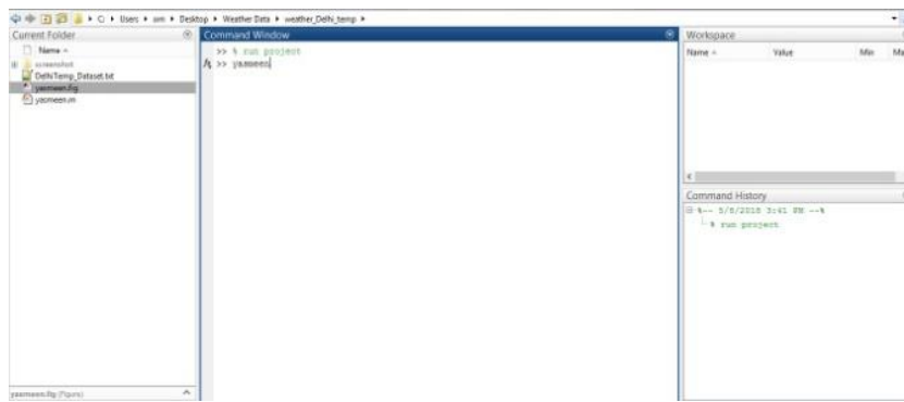
Fig 3.2: Run Command of project