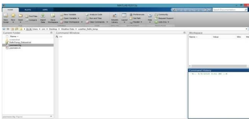
Fig 3.1: Basic Layout MATLAB of Project