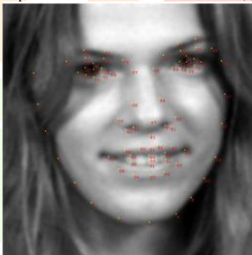
Figure 3. Sample faces with numbered landmarks from ((b) MUCT B.

Before removing estimations from the face, we initially think about the spatial dispersion of facial milestones in the countenances in the databases. Such a circulation could reveal some insight into the capability of points of interest in gender forecast.