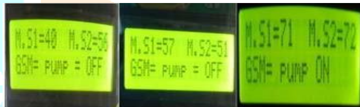
fig.3: LCD display

The LCD is a horizontal panel display unit that uses of light modulating properties of liquid crystals. The liquid crystal does not produce light straight is shown in fig.3. A 16x2 LCD display unit is very basic module and is identical normally used in different devices and circuits. These units are favoured over 7 sections and other multi sections LEDs. A 16x2 LCD displays 16 characters per line and there are 2 such lines. In this LCD, each character is presented in 5x7 pixel matrix. It uses 2 registers such as data and command. In this proposed system, character is used to display the status of moisture, pump status and GSM status [4].