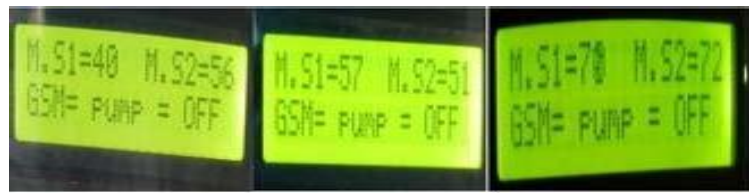
a).Moisture is low b).Moisture increase c).Moisture high motor OFF

value, which is set in the microcontroller, then the microcontroller sends the control signal to the relay, which will close the contact to turn ON the motor, corresponding status displayed in the LCD has shown in the fig.5 [11].