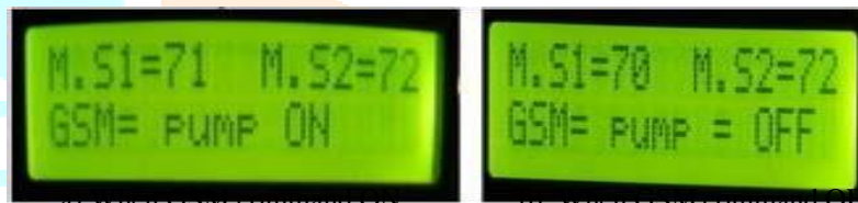
a).When GSM command ON b).When GSM command OFF

The motor continues to run and pumps water to the plants till moisture content is high. If the moisture level is high, then the effective resistance of the potential divider circuit decreases since effective resistance depends on the water content in the soil. Voltage across it decrease, this decreased-output-voltage from the sensor is amplified and is compared with the reference signal [13]. If output from the sensor is less than the threshold value by the microcontroller, then the microcontroller will send the control signal to relay to open the contact thus turning off the motor. The corresponding status displayed in the LCD has shown in the fig.6. As mentioned above, the system can also be turned on using GSM. fig.6 (a) shows the LCD display indicating that the motor is turned ON using the GSM. This shows that the motor can be turned ON as we intended from anywhere as we wish by just sending a message from our mobile phone. The GSM modem receives data and sends it to microcontroller [14][15].