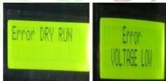
a) Dry run indication b) Low voltage

Here, the microcontroller compares the data with the data in it and it will send the signal to relay thus it turns ON the motor. Similarly, the motor can be turned OFF by sending the message to the GSM modem, the microcontroller will send desired signal to turn OFF the motor. In fig.6 (b) shows the LCD display indicating that the motor is turned OFF using GSM. If any dry run occurs, it will stop the motor. And display the error message. fig.7 (a) shows the error message. So the motor protects from dry run. fig.7 (b) shows the error message due to low voltage. So the motor will protect from important problems occurs in the practical real time systems [10].