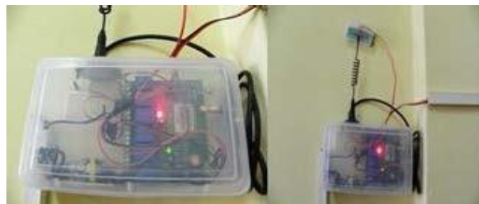
fig.4: SIM300 based GSM modem

In the proposed work, GSM receives the commands sent by the admin. These commands are transferred to microcontroller by serial communication (using Rx and Tx). It is required to send the particular AT commands to the GSM modem to retrieve the particular information stored in the modem. Once the information is transferred to the microcontroller, it will process as per the coding. Example if the admin sends the 'START' command to the GSM modem through the registered mobile number. The microcontroller compares the code if the command matches, it gives the signal to relay driver. So that relay will energize and pump will start [7].